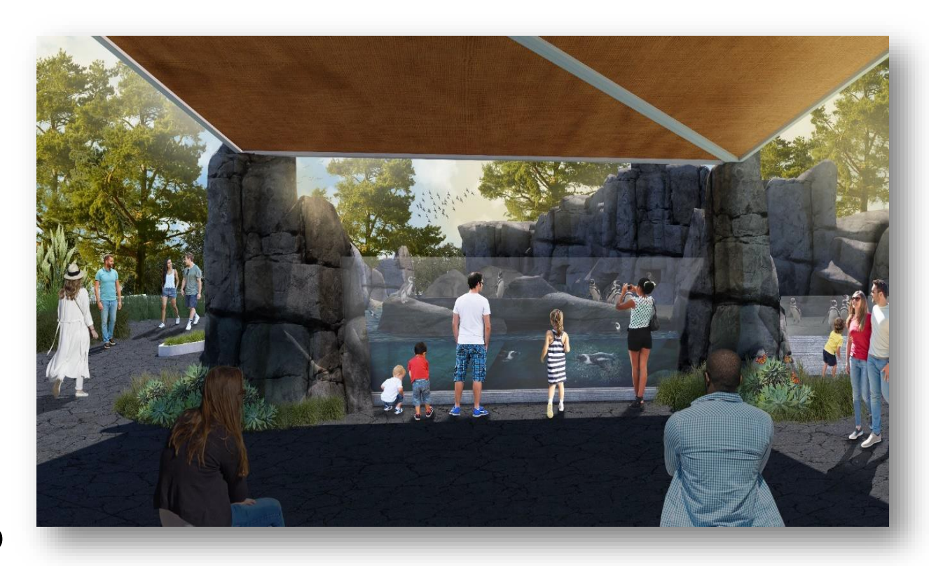
Artistic Rendering – Penguin Exhibit