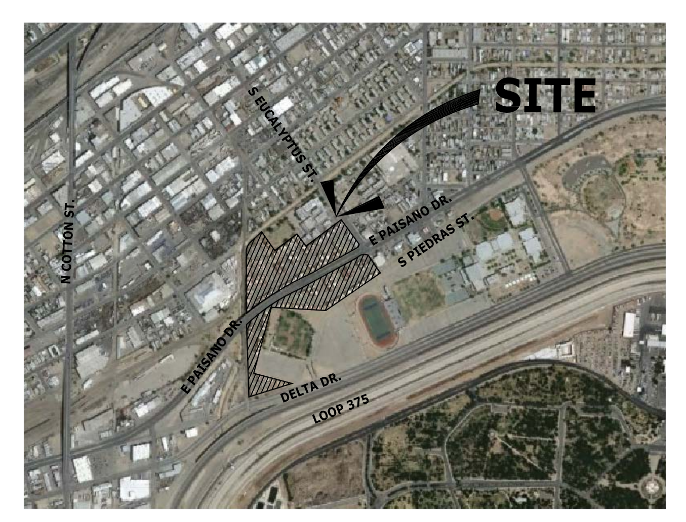
VICINITY MAP SCALE: 1" = 1000'