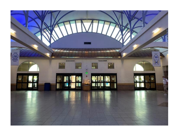
Airport Mural Project