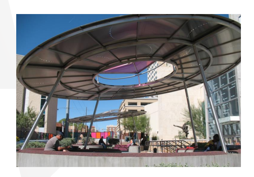
Sombras y Luz & Novel Romance