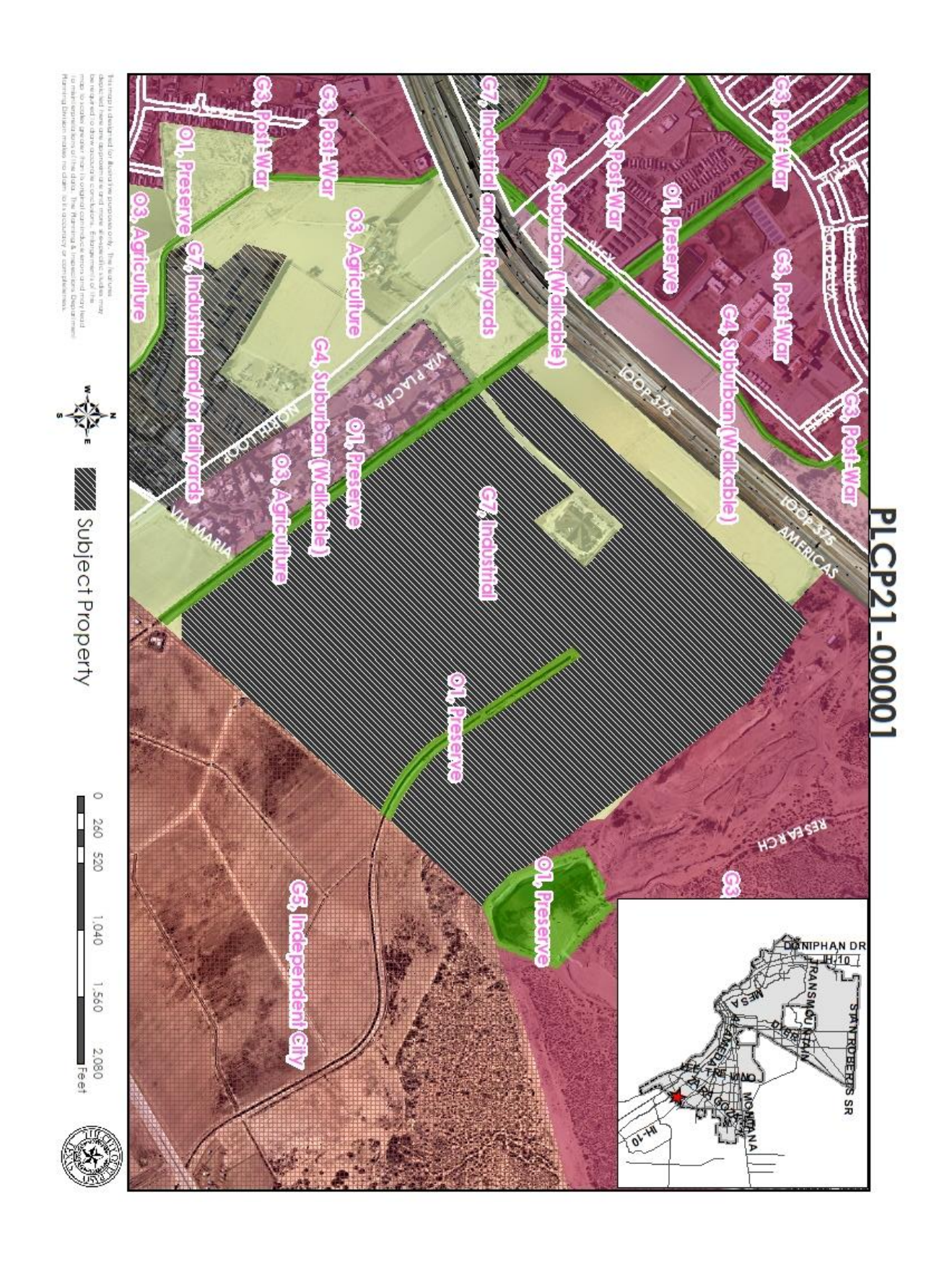
Exhibit A: Future Land Use Map