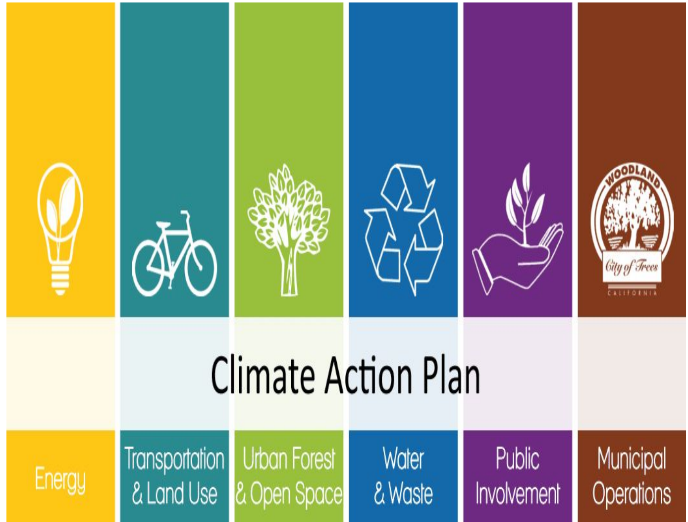
Image from the City of Woodland, California Climate Action Plan