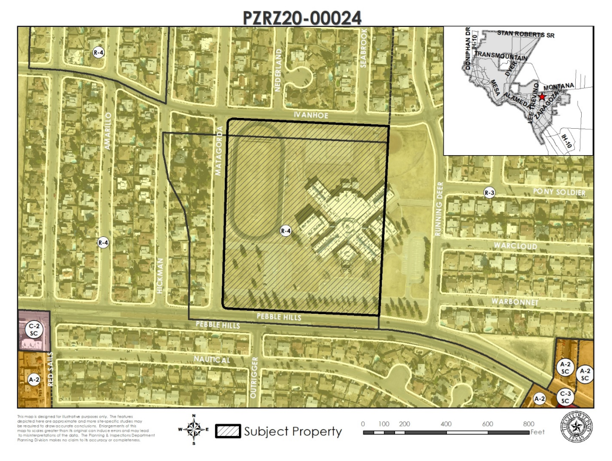
Figure A. Subject Property & Immediate Surroundings

SUMMARY OF STAFF RECOMMENDATION: Staff recommends APPROVAL of the request. The proposed new middle school development is consistent with adjacent residential properties within its vicinity and is in keeping with the policies of Plan El Paso for the G-3, Post-War Future Land Use Designation in the East Planning Area.