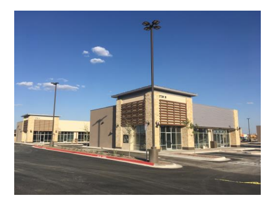
Property uses in the area