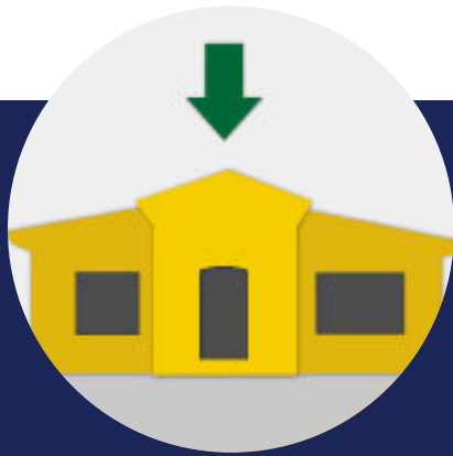
More focused Agendas