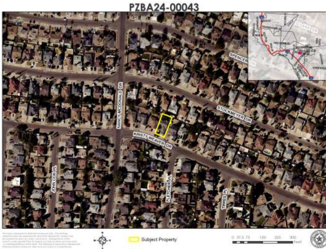
Figure A. Aerial of Subject Property & Immediate Surroundings

SUMMARY OF STAFF'S RECOMMENDATION: Staff recommends APPROVAL of the special exception request as the requested encroachment is less than the encroachments into that setback already present on at least two other neighboring properties.