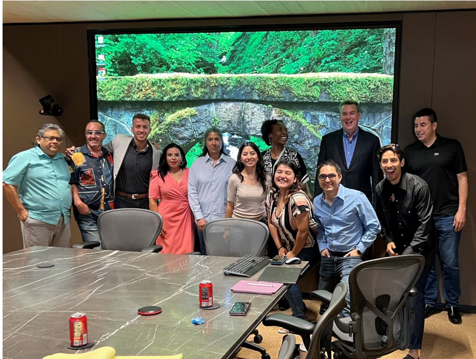
Innovation Workshop Participants