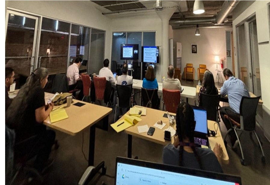
Venture Mentoring Service Patent and IP Workshop