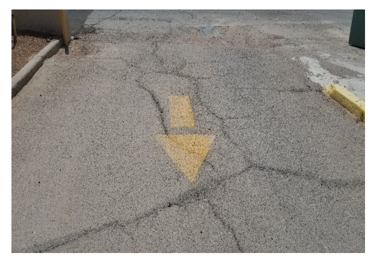
Pavement is deteriorating