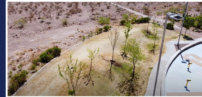
Don Haskins Park (2021)