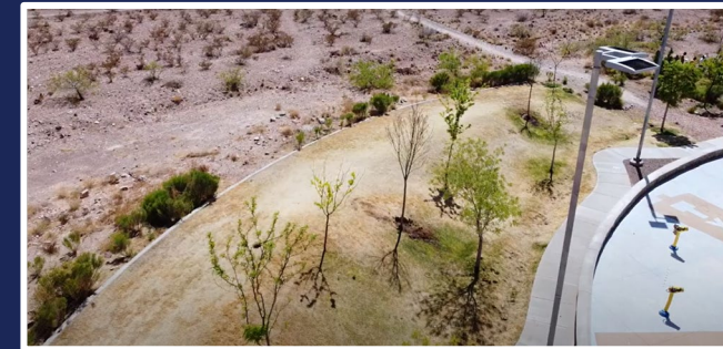
Don Haskins Park (2021)