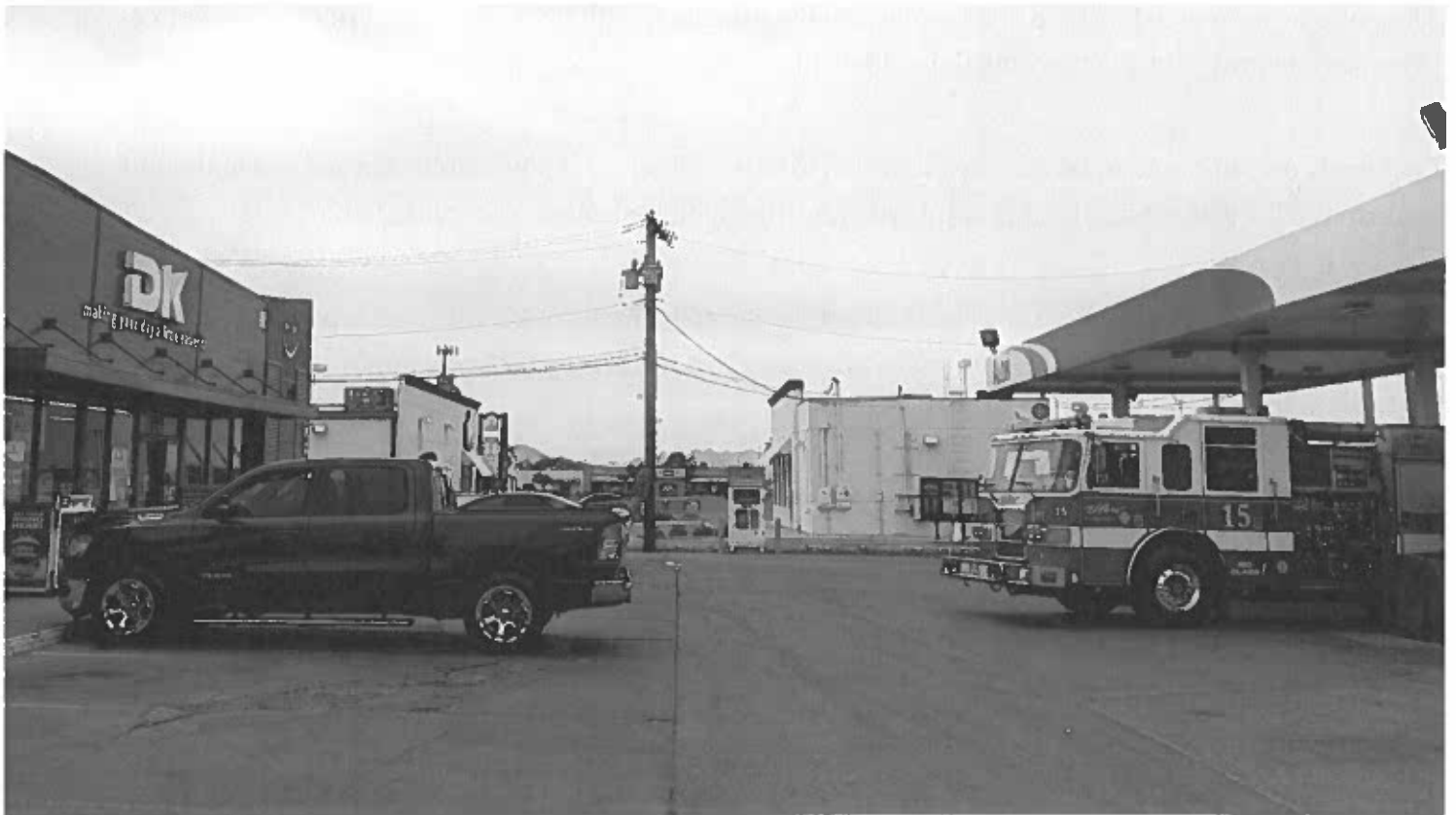
A city of El Paso fire truck gets fueled up at the Alon gas station at Doniphan and Redd roads on Friday.

That's when the city entered into a contract with Western Refining to allow city vehicles – including police, fire and environmental services vehicles – to fuel up at several locations citywide, documents show. The mayor and city representatives were also allowed to purchase gas at taxpayers expense from those locations as “designated departmental users,” according to city documents. The contract was renewed in 2011.