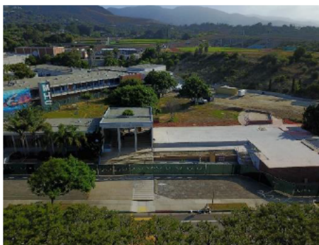
MALIBU MS & HS CAMPUS IMPROVEMENTS PROJECT