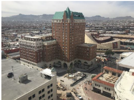
HOTEL PASO DEL NORTE MARRIOTT AUTOGRAPH COLLECTION

Project consisted of demolition of existing administration / Library, construction of New Library and Admin building, parking lot and modernization of existing classroom building and other related work including abatement, site work amenities - Field Track and parking lots.