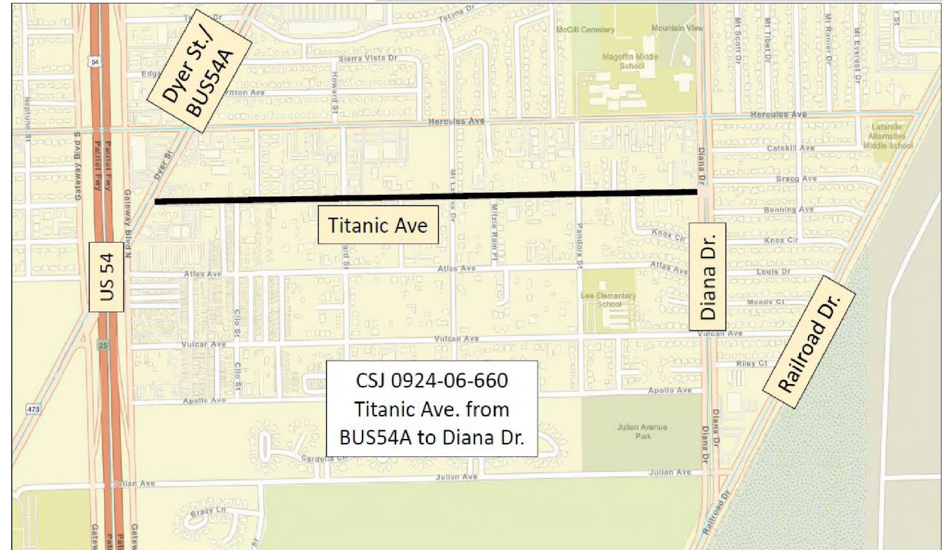
Titanic Ave from BU54A to Diana Drive