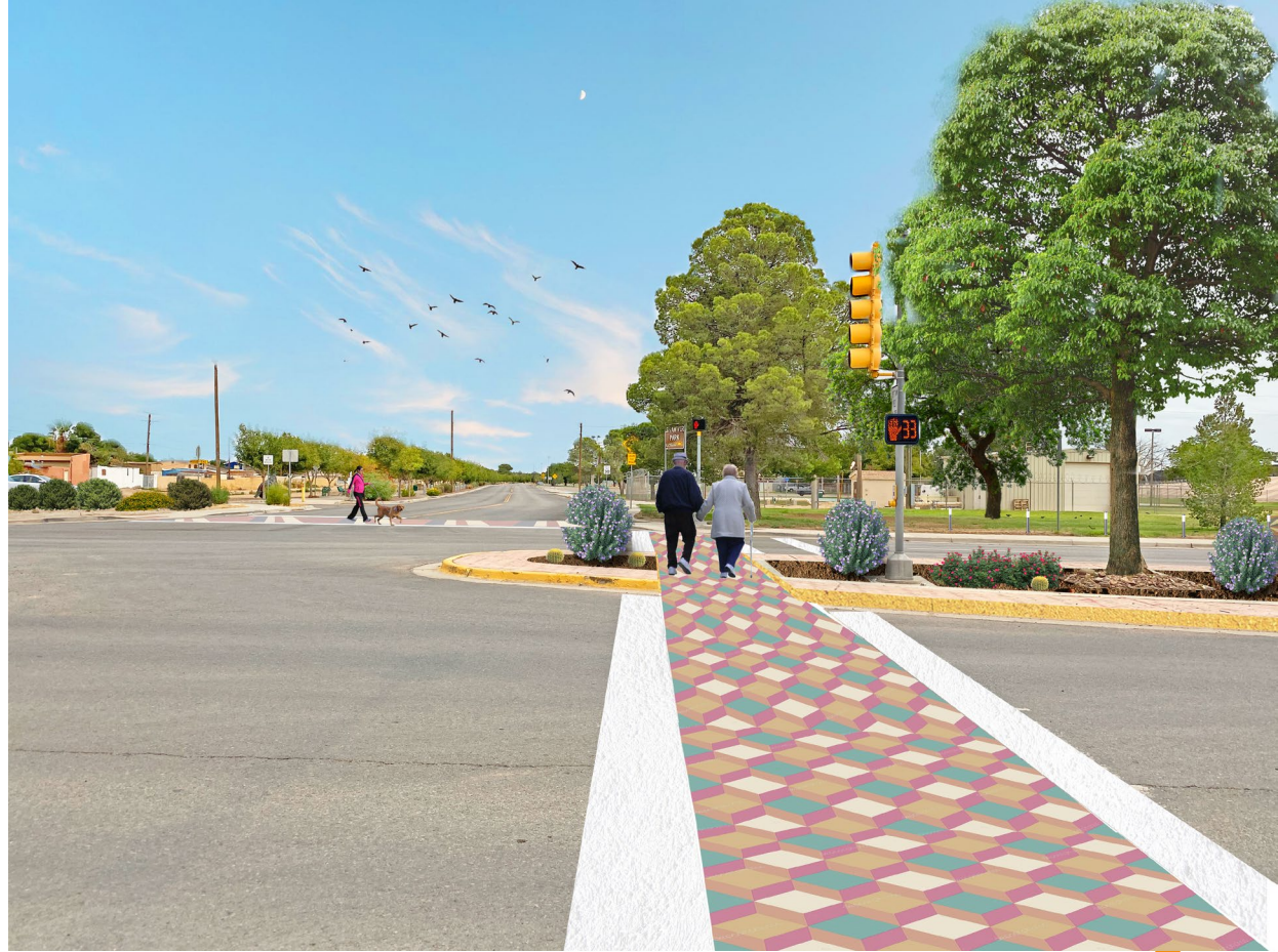
ALL USER FOCUSED