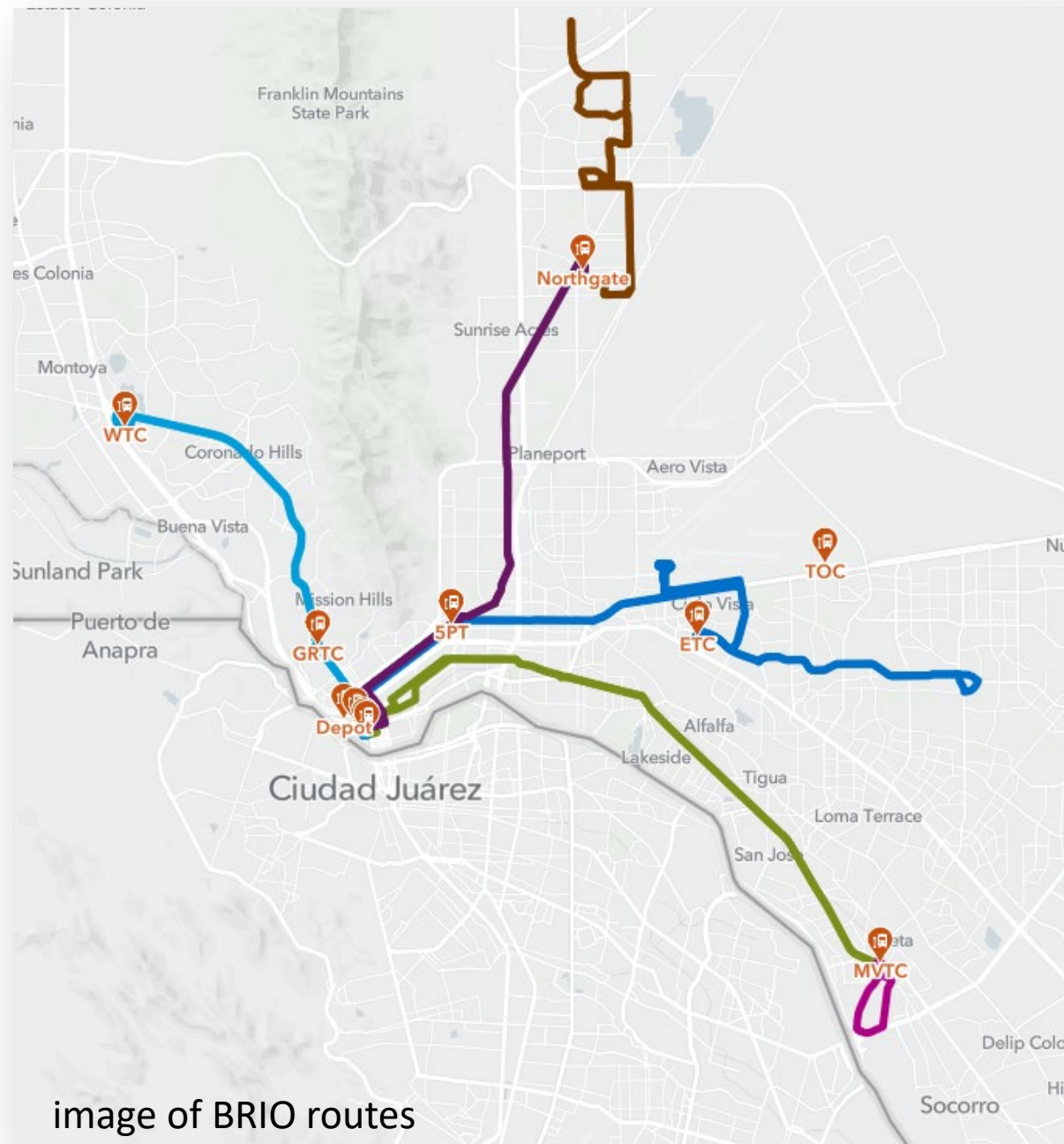
image of BRIO routes

SUNDAY BRIO SERVICES IMPROVED CONNECTIVITY