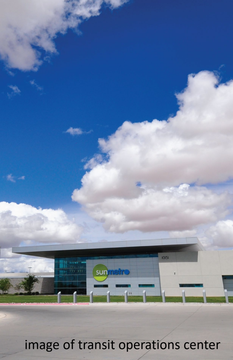
image of transit operations center