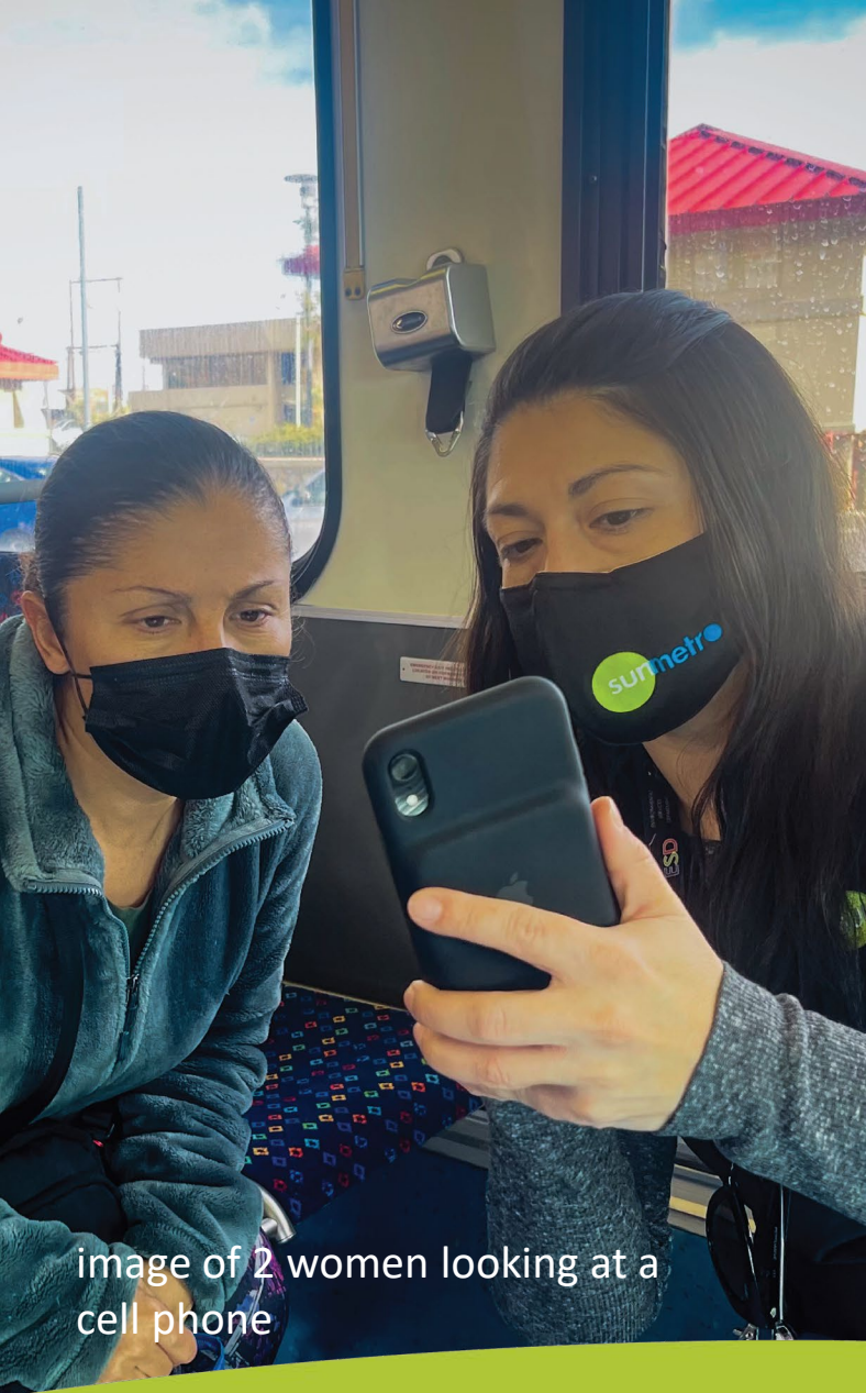
image of 2 women looking at a cell phone