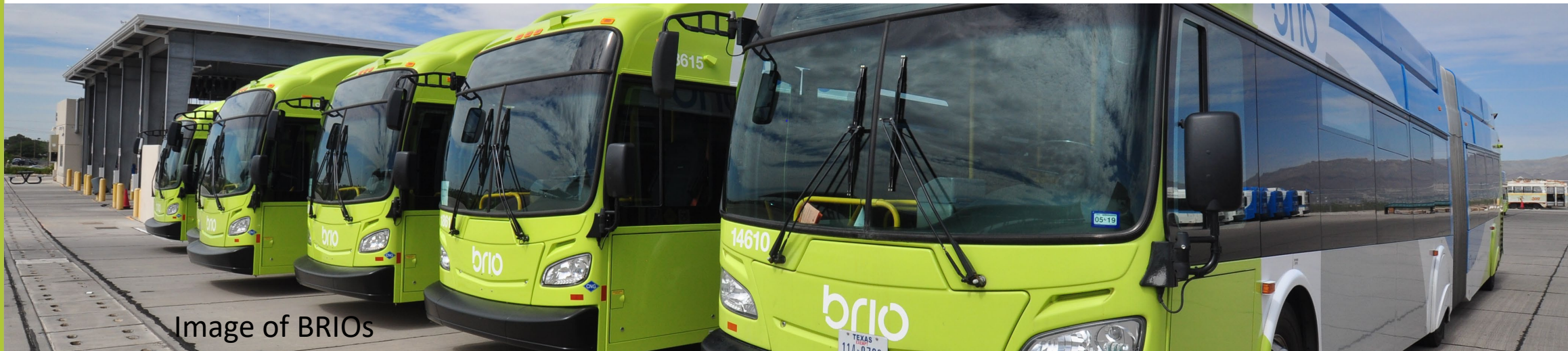
Image of BRIOs