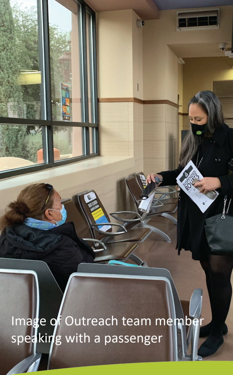
Image of Outreach team member speaking with a passenger