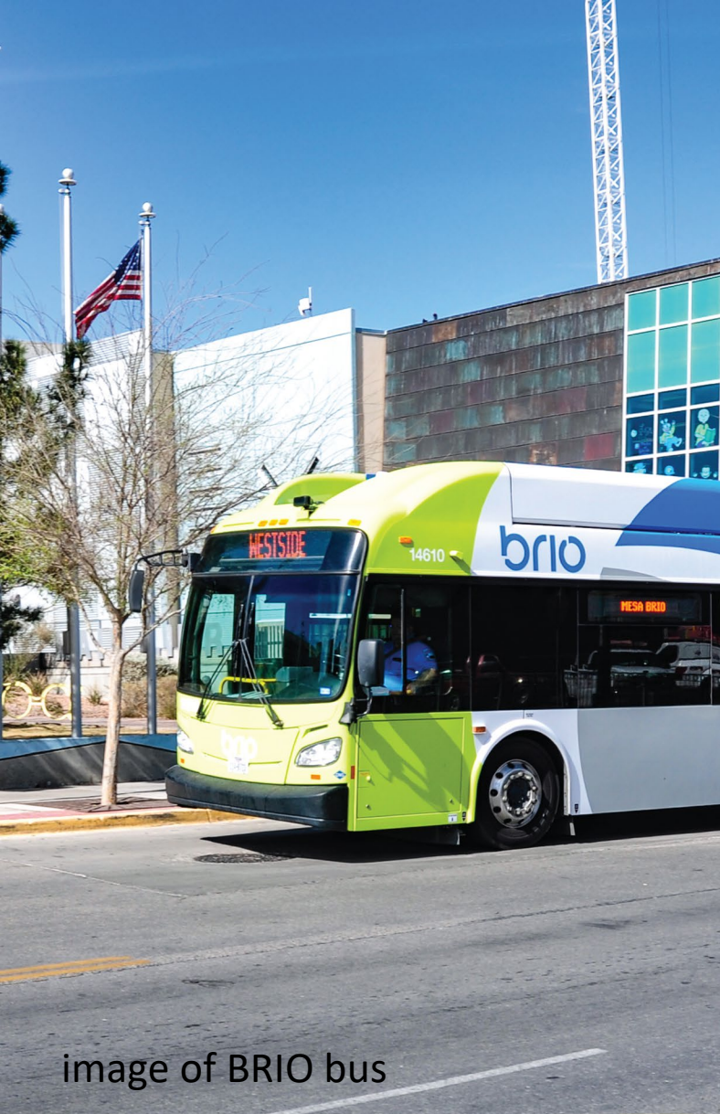
image of BRIO bus