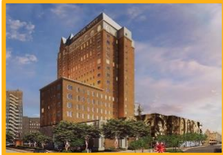
Paseo del las Luces