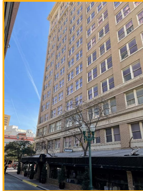
Exterior at Alley south of the Plaza Hotel