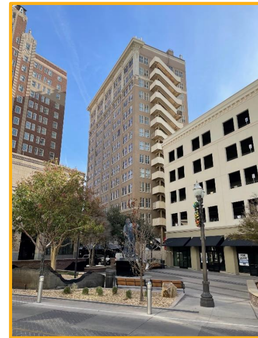
Façade from Pioneer Plaza