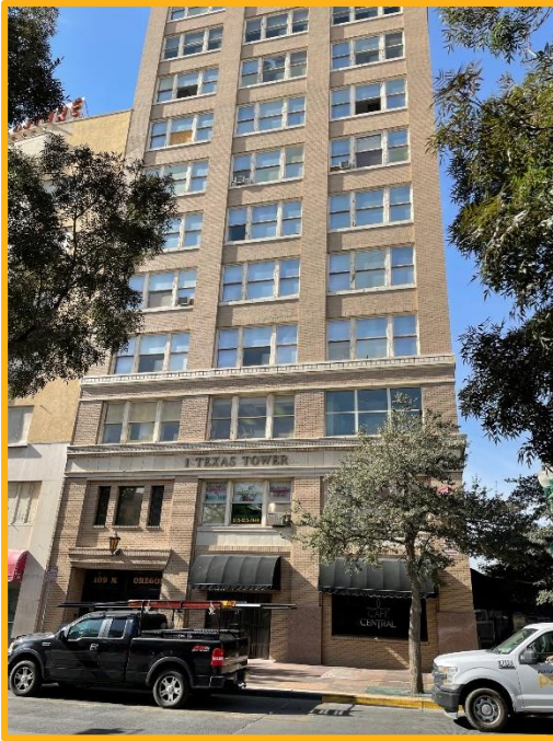
Exterior at North Oregon Street