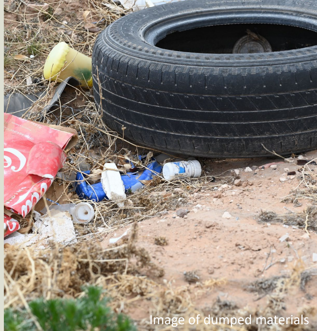
Image of dumped materials