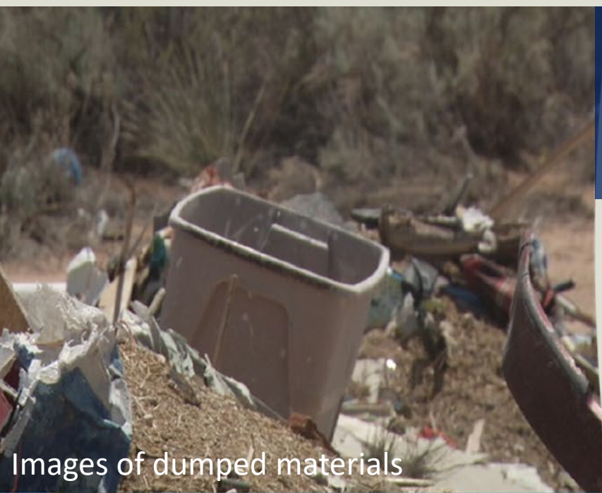
Images of dumped materials