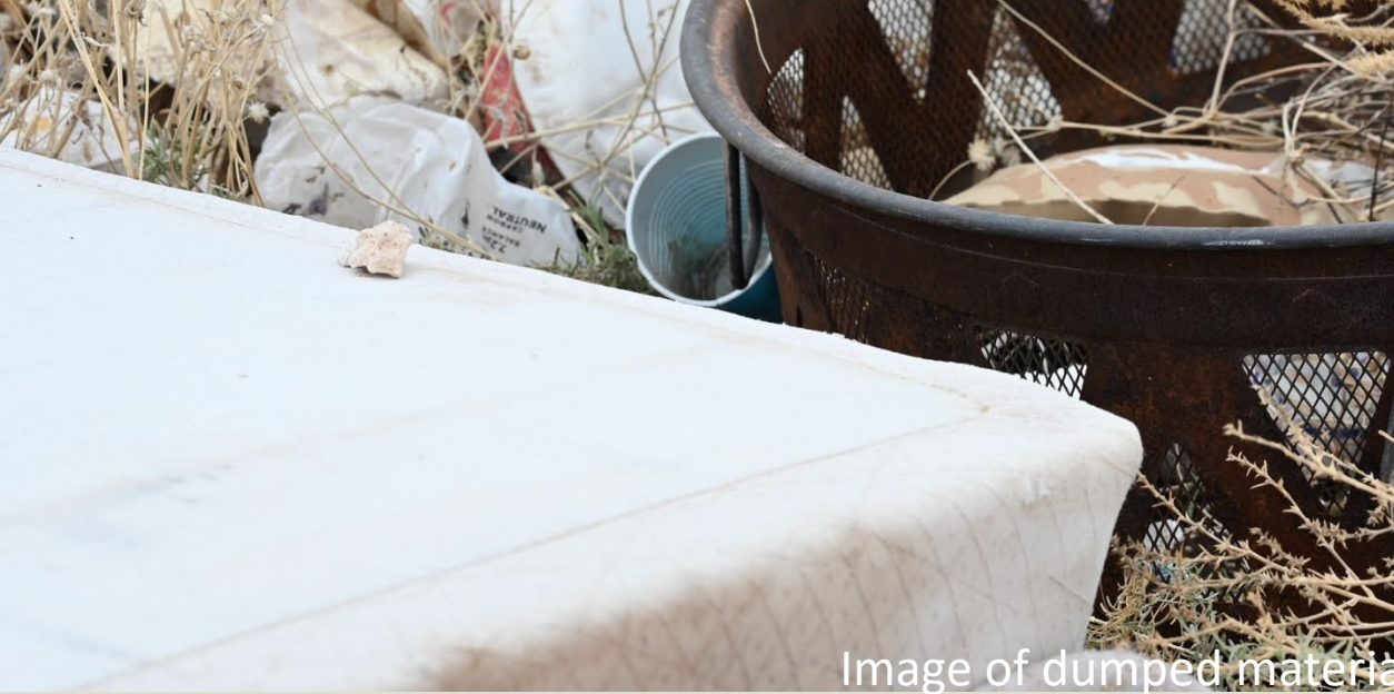
Image of dumped materials