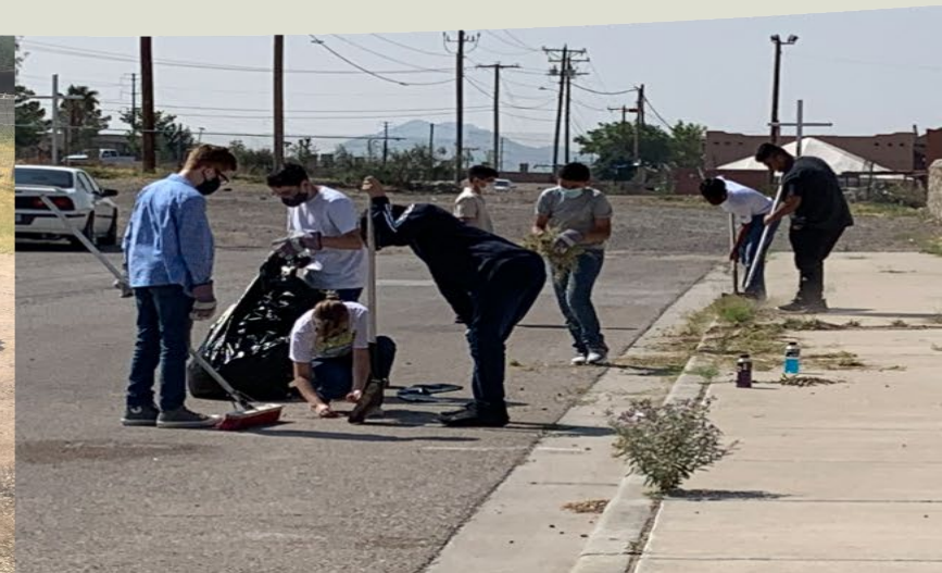
Images of shovels, bagged garbage and people cleaning