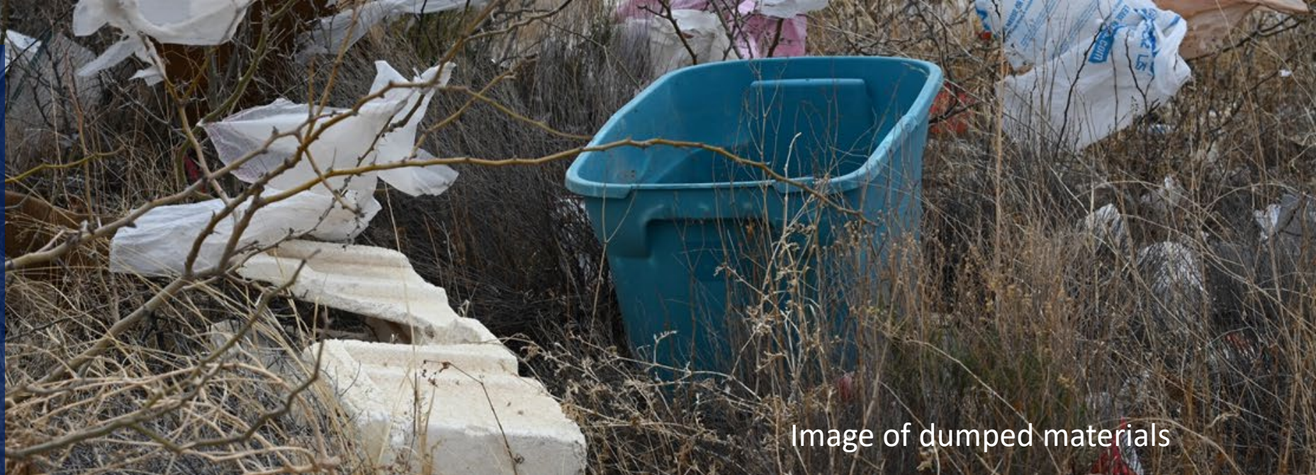
Image of dumped materials