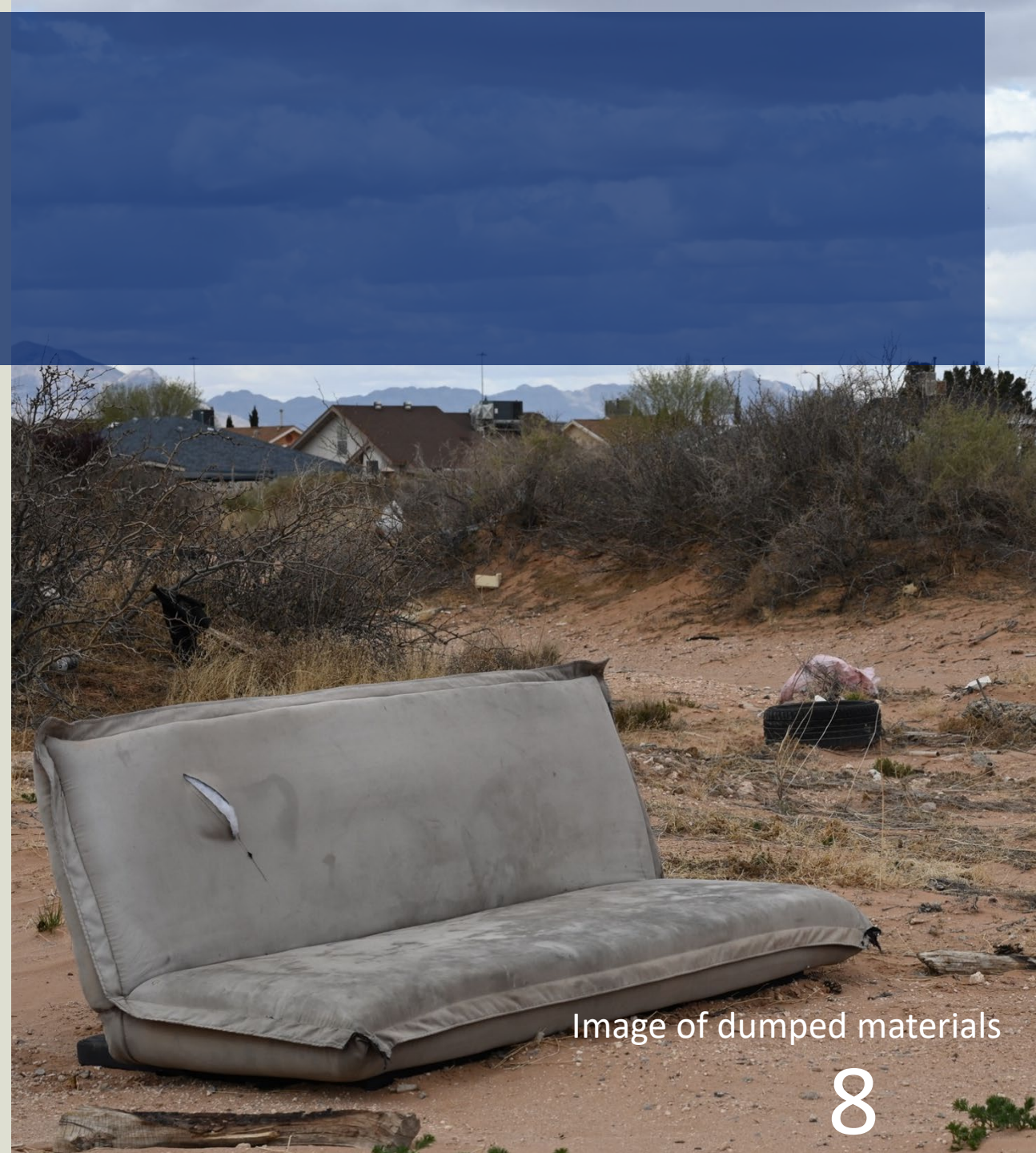
Image of dumped materials