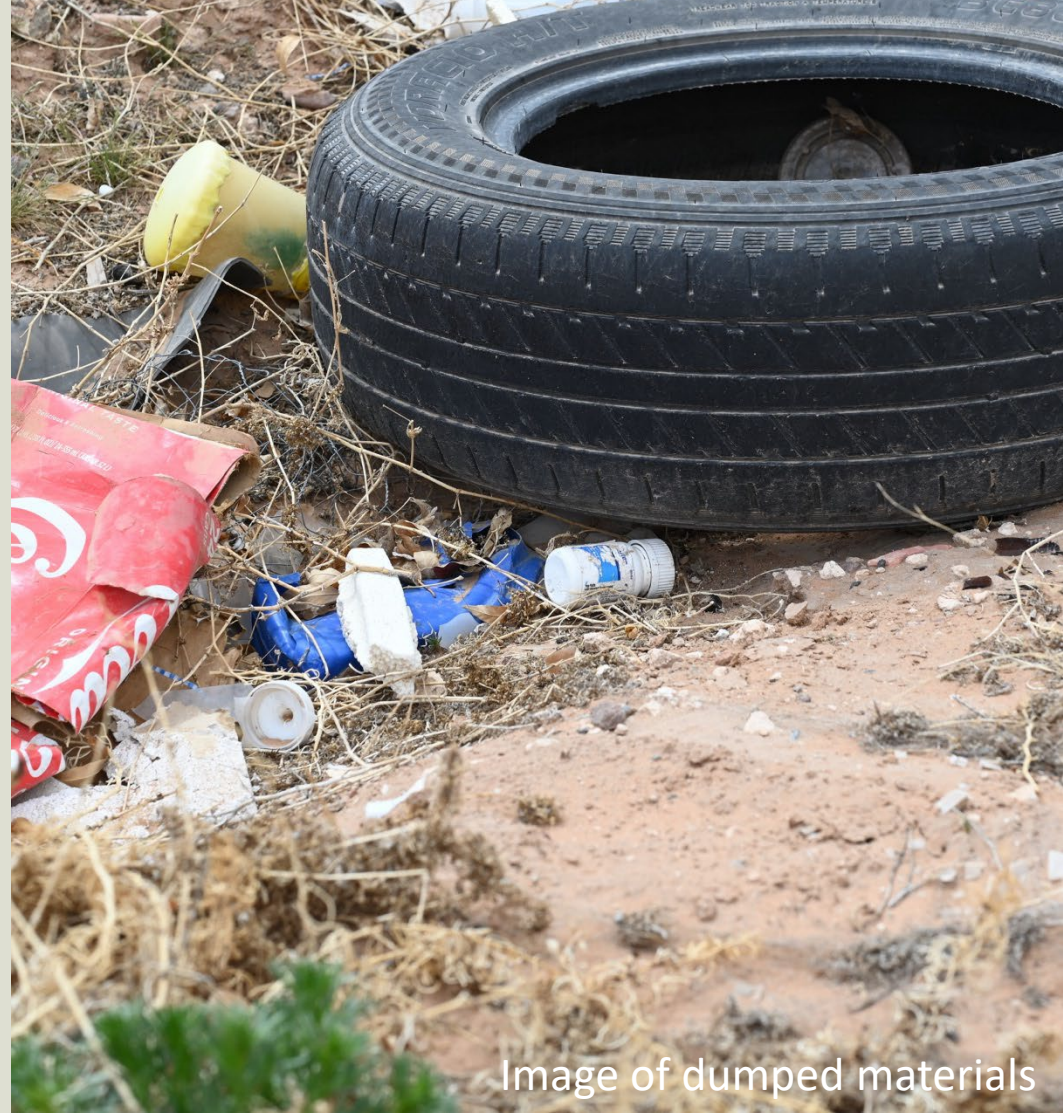
Image of dumped materials