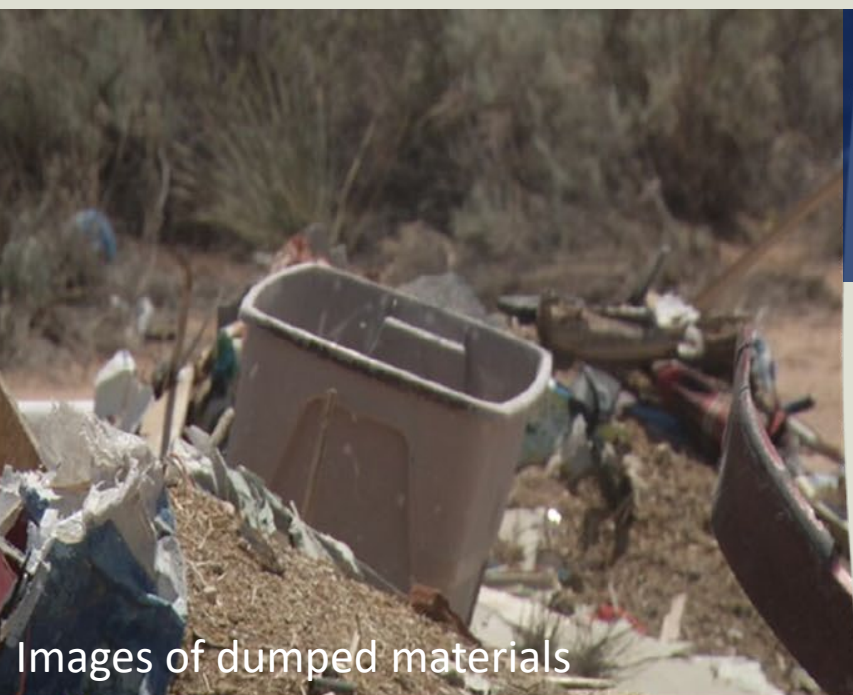
Images of dumped materials