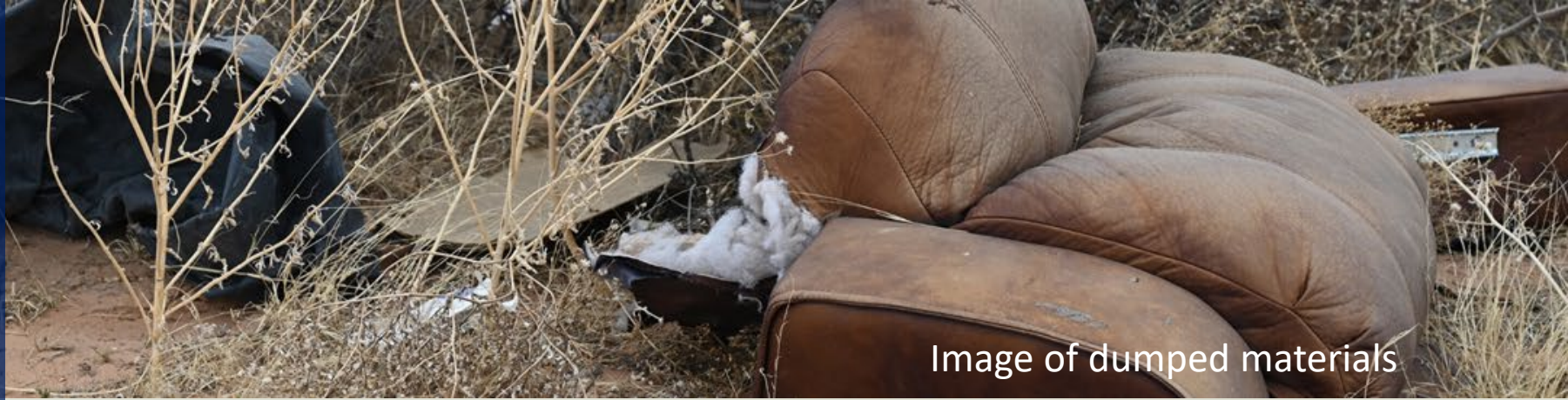
Image of dumped materials