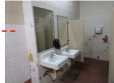
Existing Conditions / Demo Plan