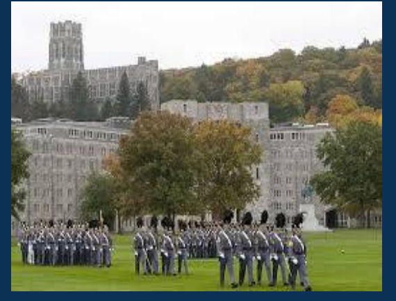
United States Military Academy