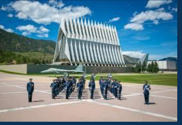
United States Air Force Academy