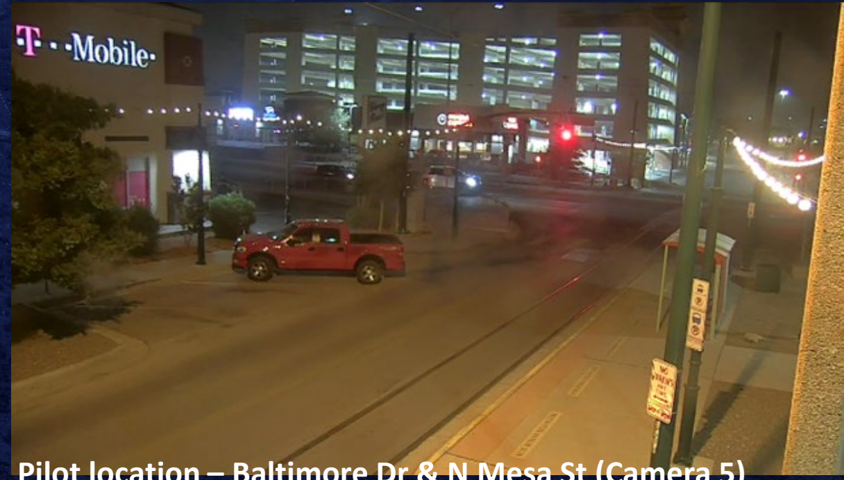
Pilot location – Baltimore Dr & N Mesa St (Camera 5)