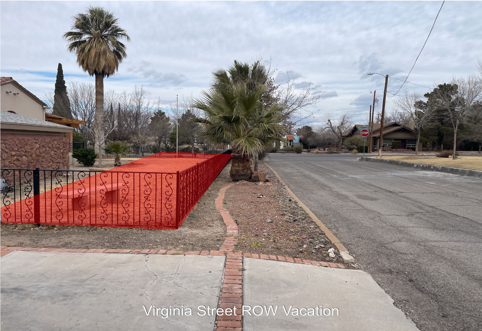
Virginia Street ROW Vacation