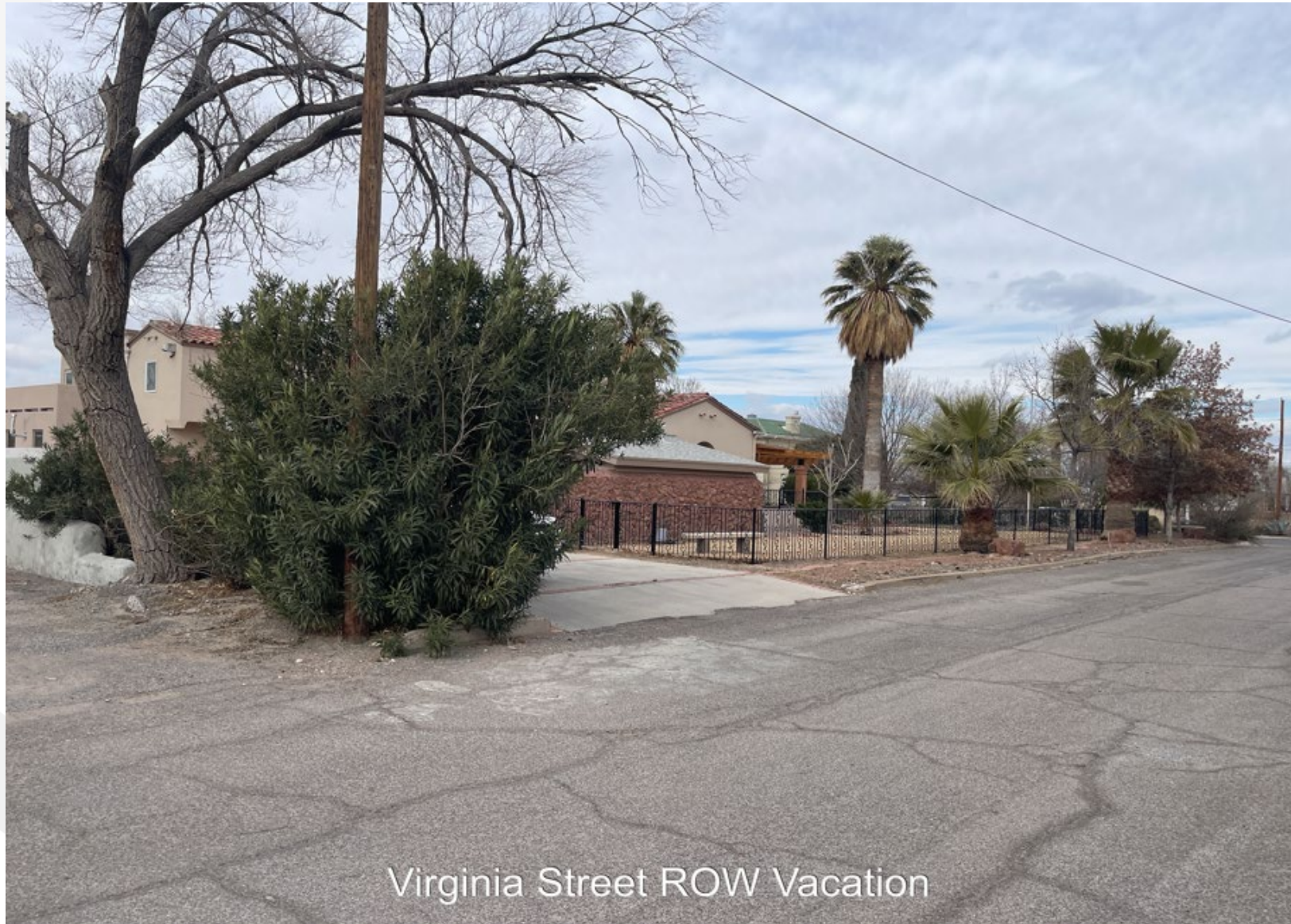
Virginia Street ROW Vacation