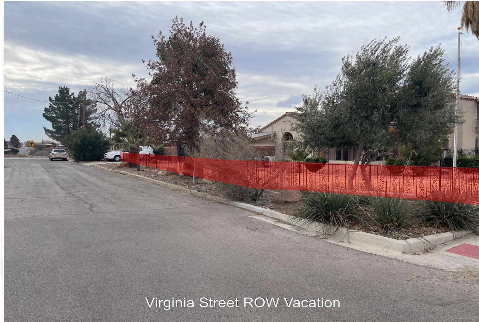
Virginia Street ROW Vacation