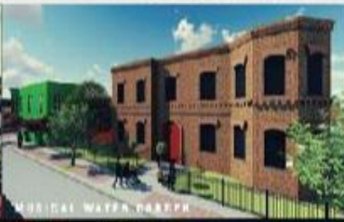
MUSICAL WALK GARDEN