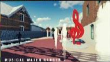
MUSICAL WALK GARDEN