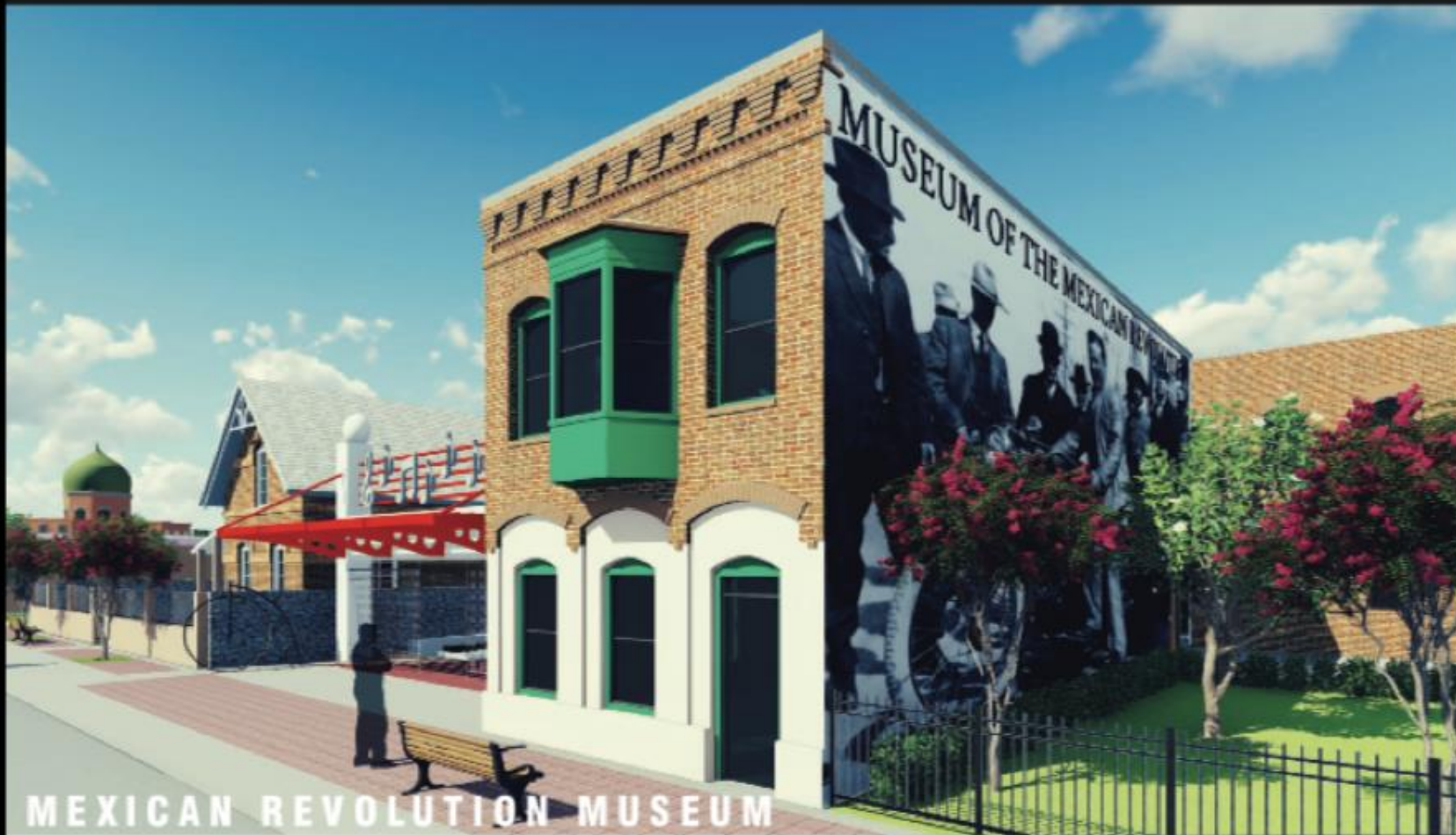
MEXICAN REVOLUTION MUSEUM

“It would be more economical to preserve historic treasures than to replace them with buildings of similar quality.”