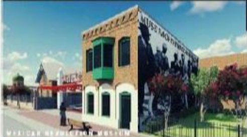
MEXICAN HERITAGE MUSEUM