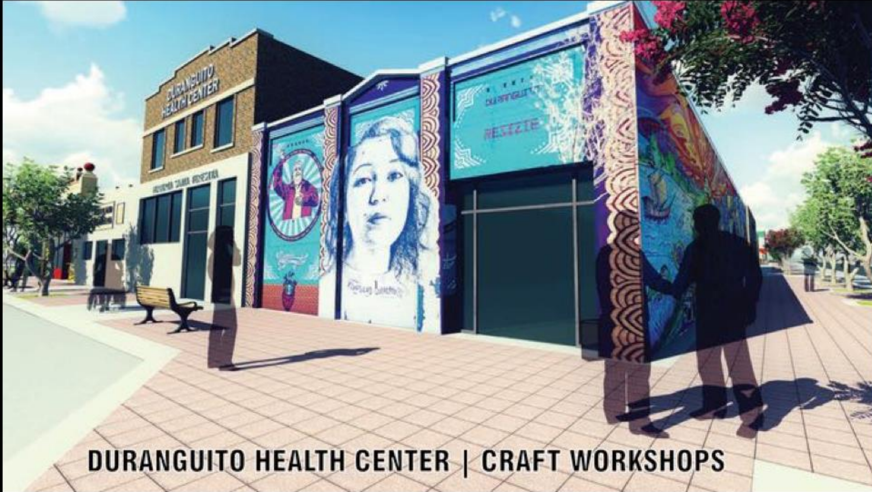
DURANGUITO HEALTH CENTER | CRAFT WORKSHOPS

Encourage new commercial and live/work uses within historic districts to make them more economically viable and livable.