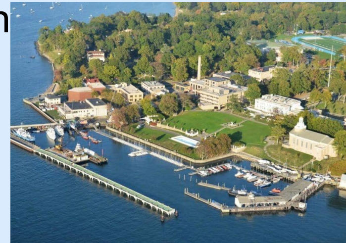
United States Merchant Marine Academy