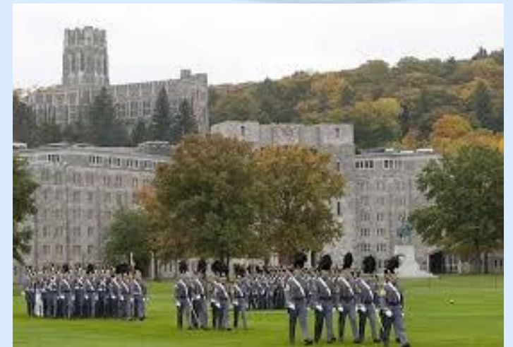
United States Military Academy

Questions? Email ServiceAcademy.TX16@mail.house.gov