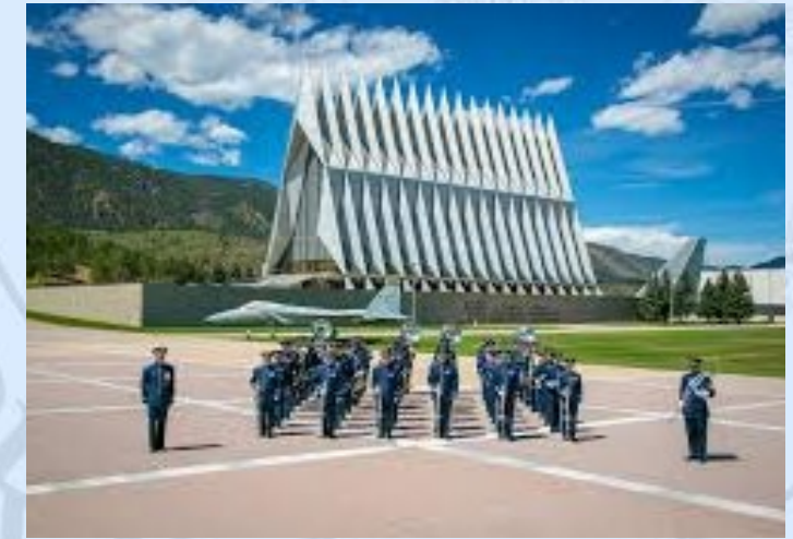
United States Air Force Academy