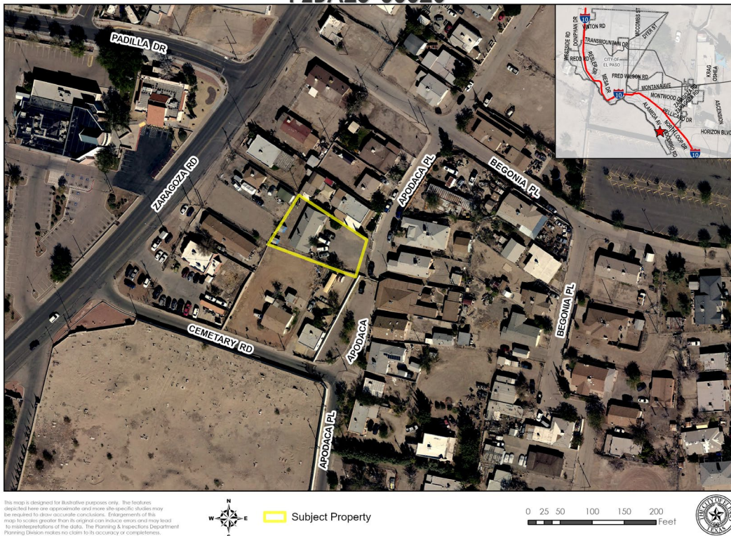
Figure A. Aerial of Subject Property & Immediate Surroundings