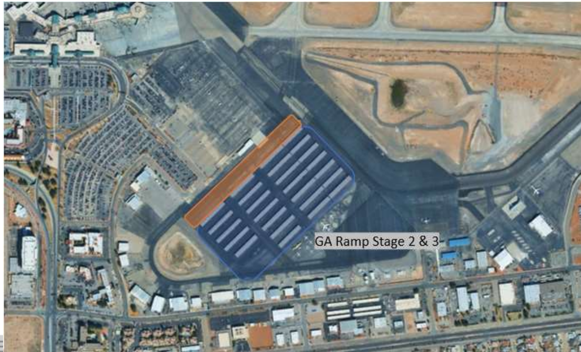
El Paso International Airport General Aviation Area – Stage 2 & 3