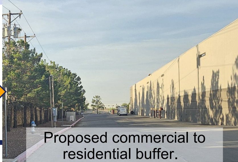
Proposed commercial to residential buffer.