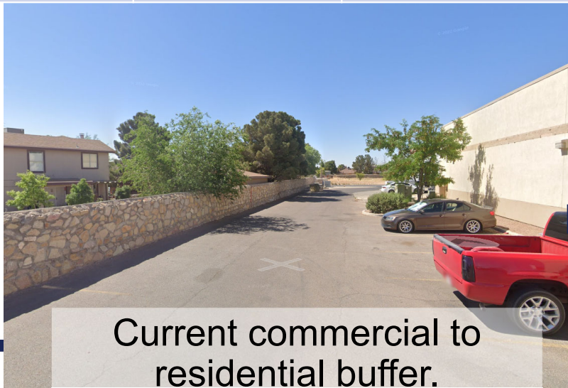
Current commercial to residential buffer.