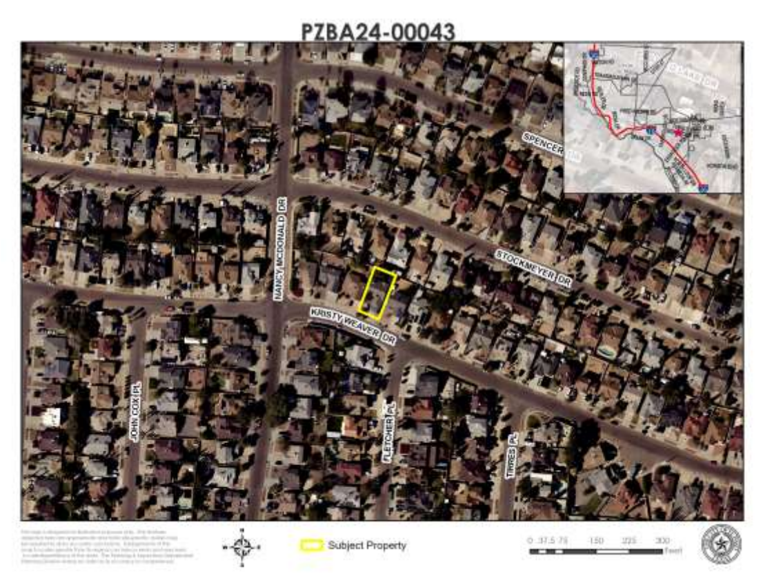
Figure A. Aerial of Subject Property & Immediate Surroundings

SUMMARY OF STAFF'S RECOMMENDATION: Staff recommends APPROVAL of the special exception request as the requested encroachment is less than the encroachments into that setback already present on at least two other neighboring properties.