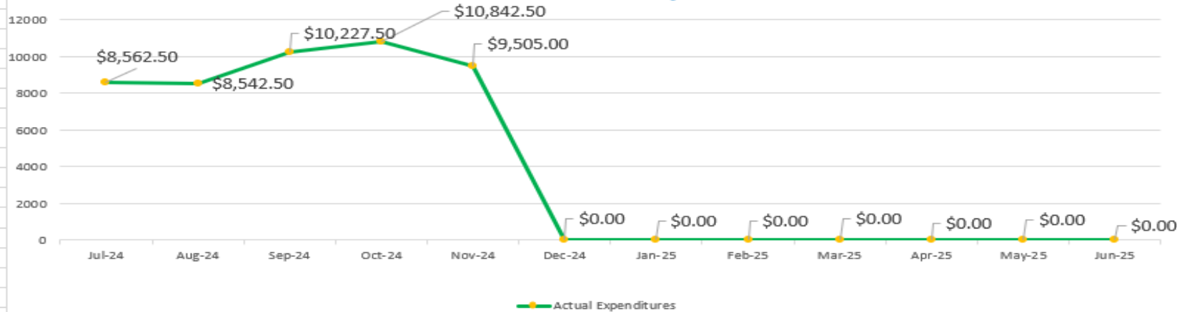
Actual Grant Expenditures

$100,000.00 Projected Grant Expenditures