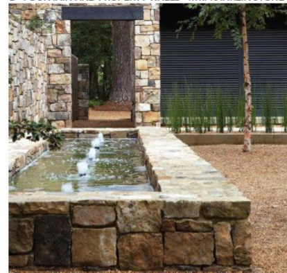
H - EXTERIOR WOOD BEAMS