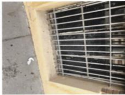
WINDOW #7 OREGON STREET