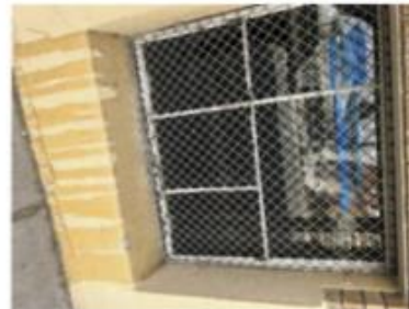
WINDOW #5 OREGON STREET