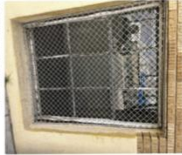
WINDOW #2 OREGON STREET