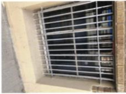
WINDOW #6 OREGON STREET