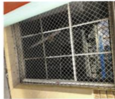
WINDOW #3 OREGON STREET