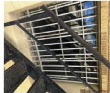
WINDOW #4 OREGON STREET