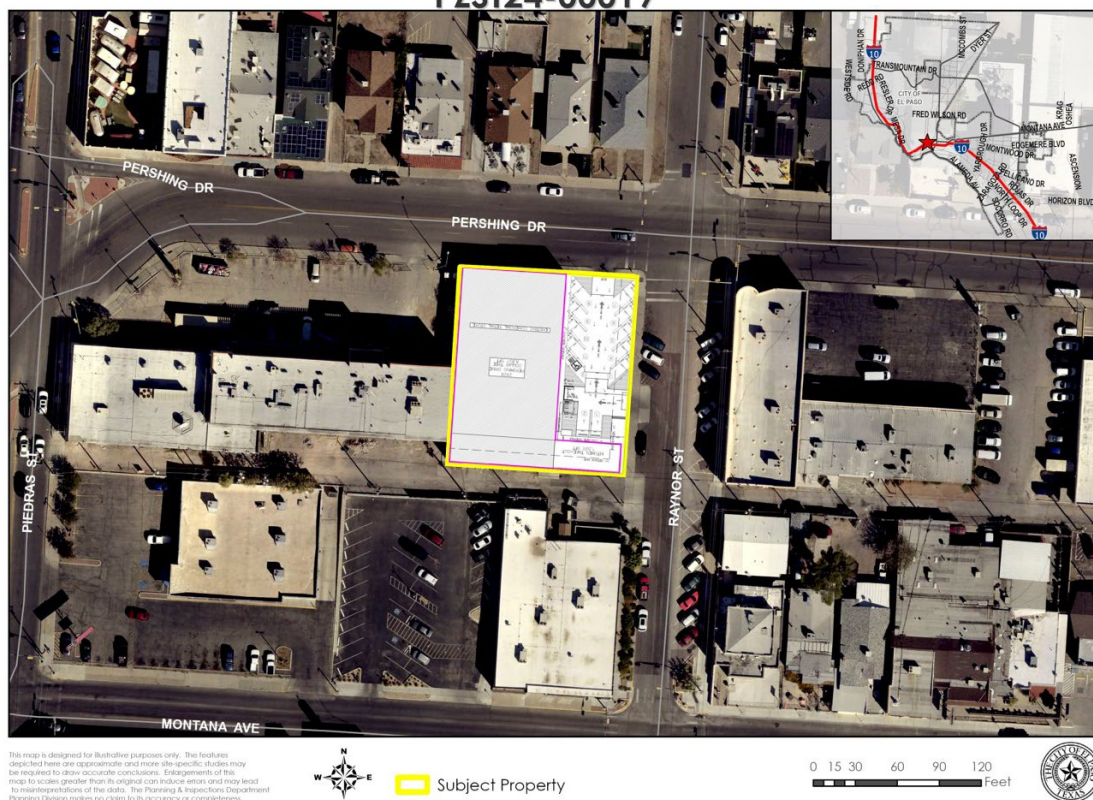
Figure A. Subject Property & Immediate Surroundings