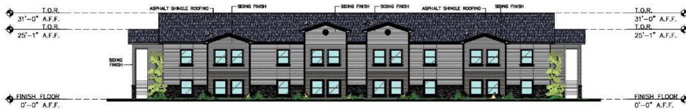
TYP. FRONT ELEVATION 5