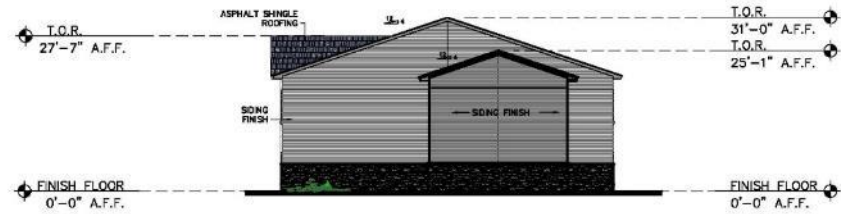
TYP. SIDE ELEVATION 4