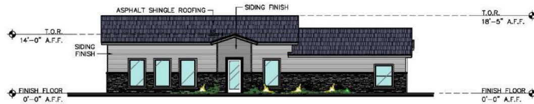
CLUB HOUSE/APARTMENT FRONT ELEVATION 3