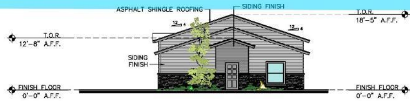
CLUB HOUSE/APARTMENT SIDE ELEVATION 2