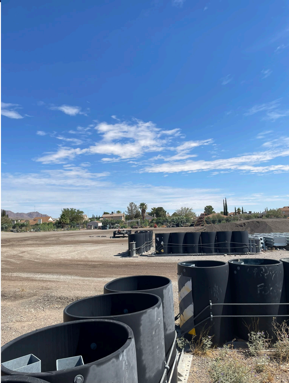
Site Top View