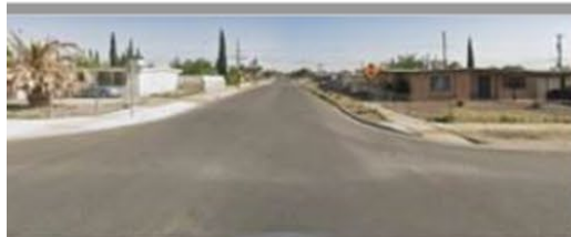
Wadsworth Ave & Murphy St Intersection