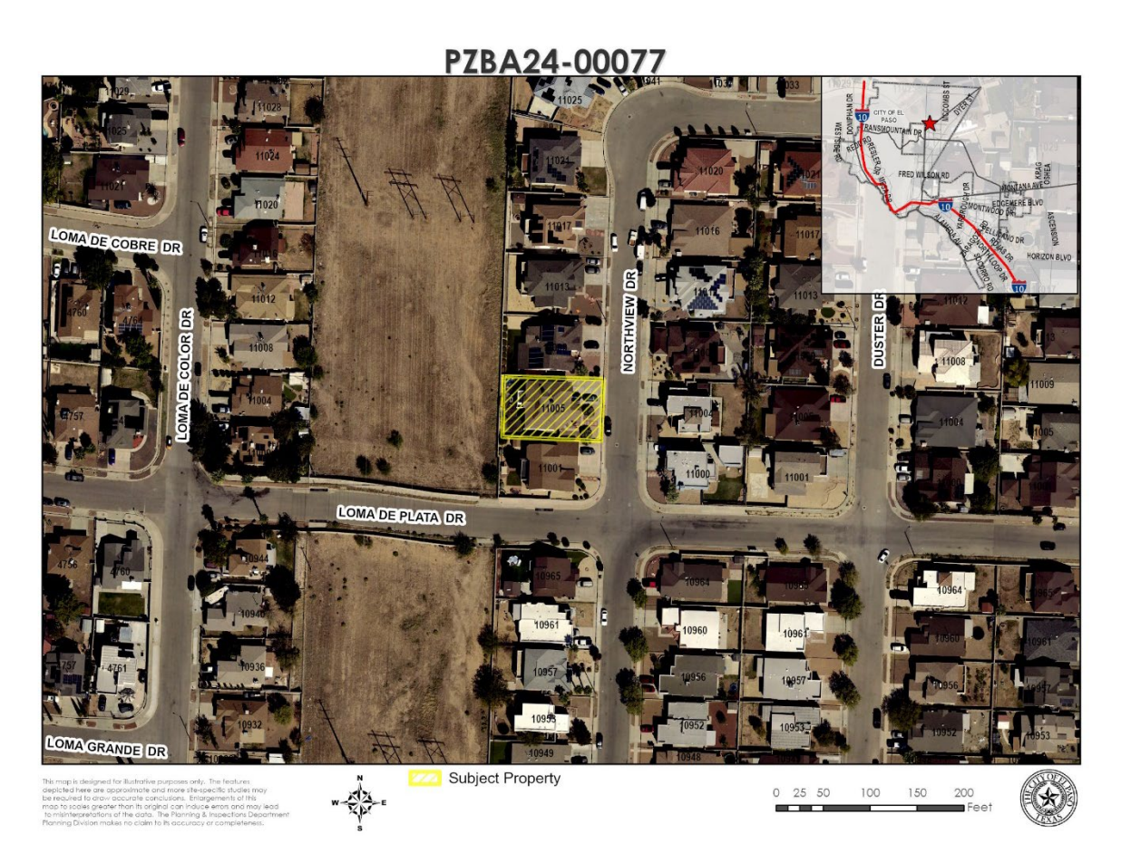
Figure A. Aerial of Subject Property & Immediate Surroundings

SUMMARY OF STAFF'S RECOMMENDATION: Staff recommends APPROVAL of the special exception request as the requested area of encroachment is less than the maximum permitted.