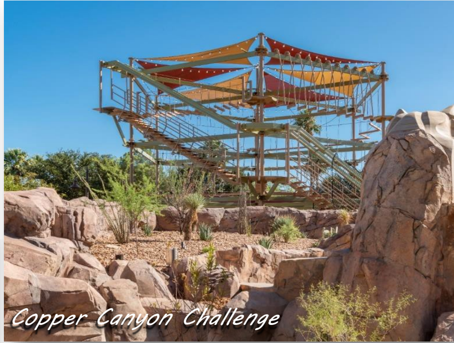
Copper Canyon Challenge