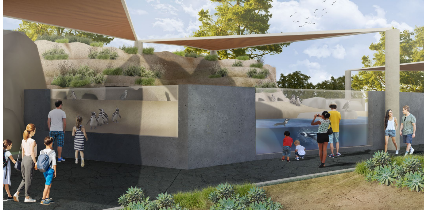
Artistic Rendering – Penguin Exhibit