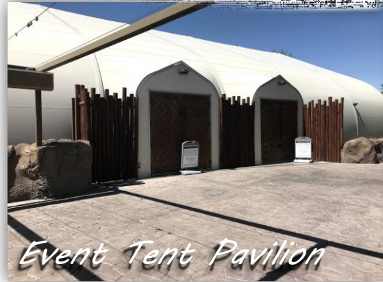
Event Tent Pavilion