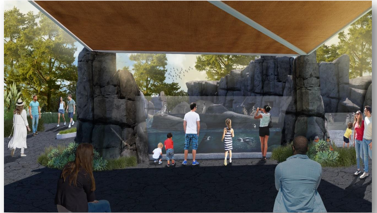
Artistic Rendering – Penguin Exhibit