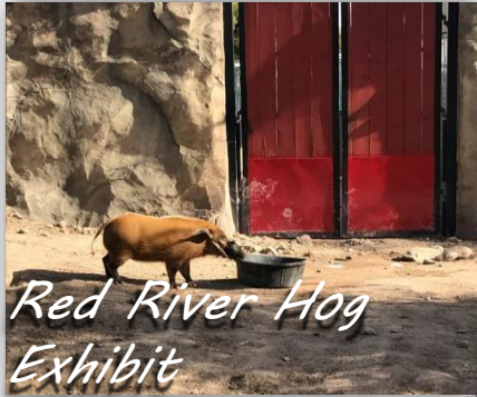
Red River Hog Exhibit