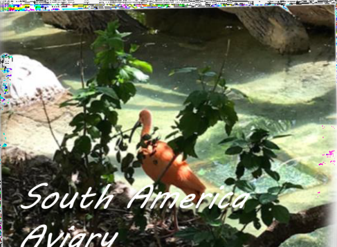
South America Aviary