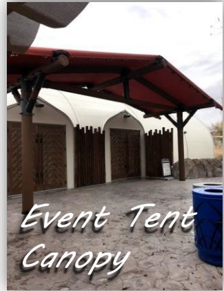
Event Tent Canopy