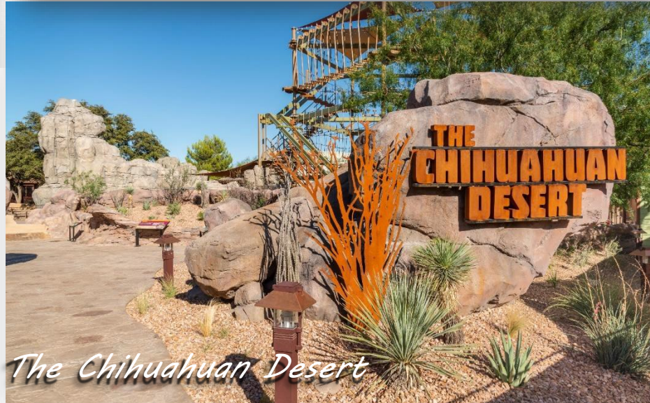
The Chihuahuan Desert