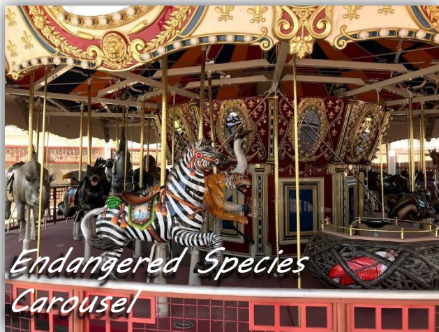
Endangered Species Carousel