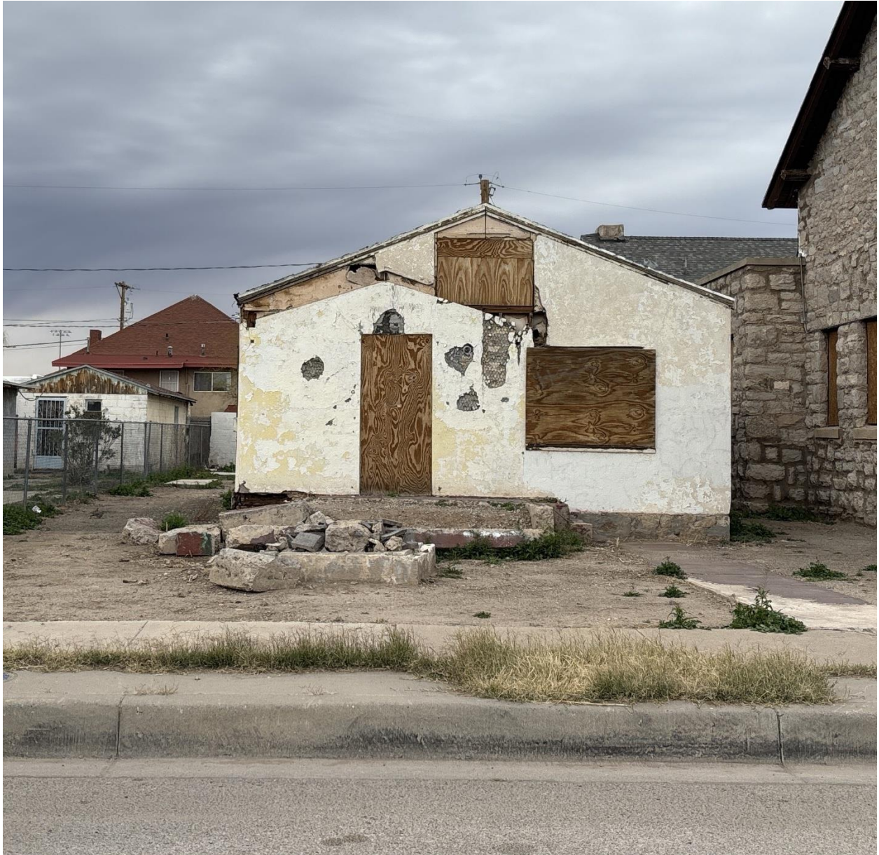
Front elevation picture