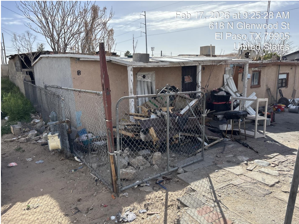
Front elevation picture