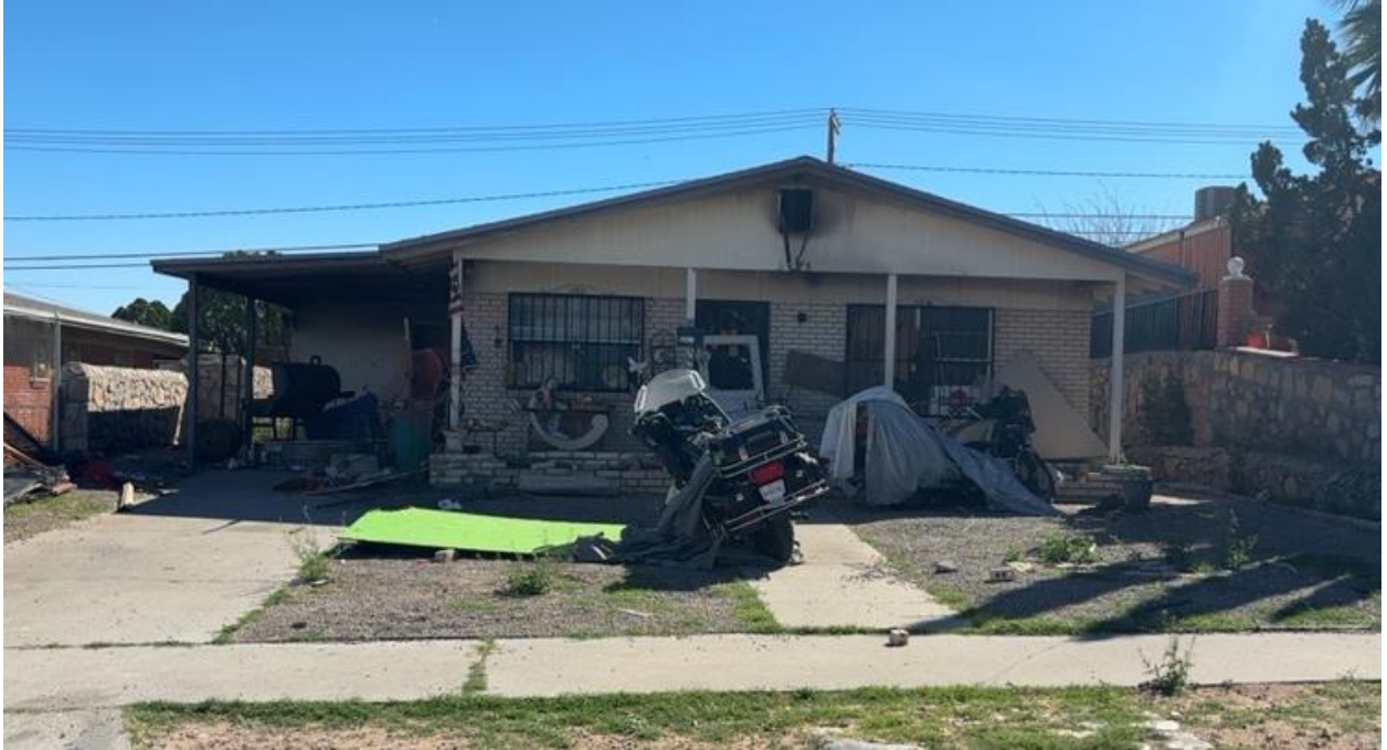
Front elevation picture

BUILDING AND STANDARDS BOARD AGENDA FOR April 16, 2026