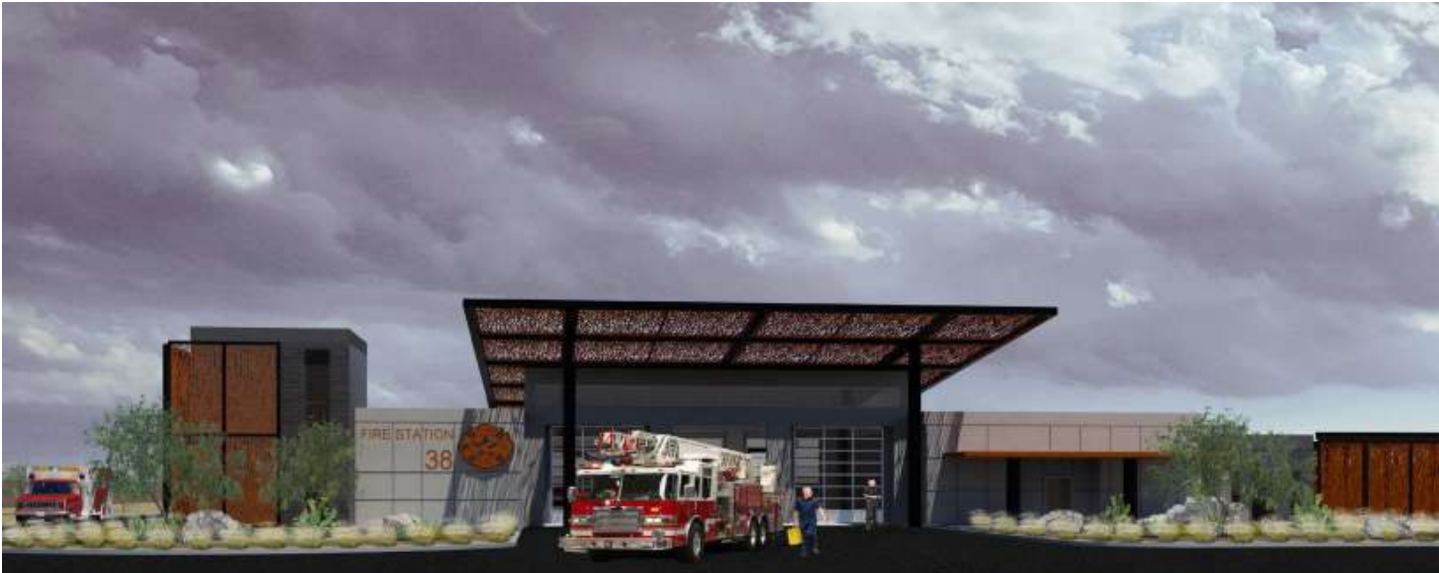
Preliminary Architectural Rendering (design may vary)