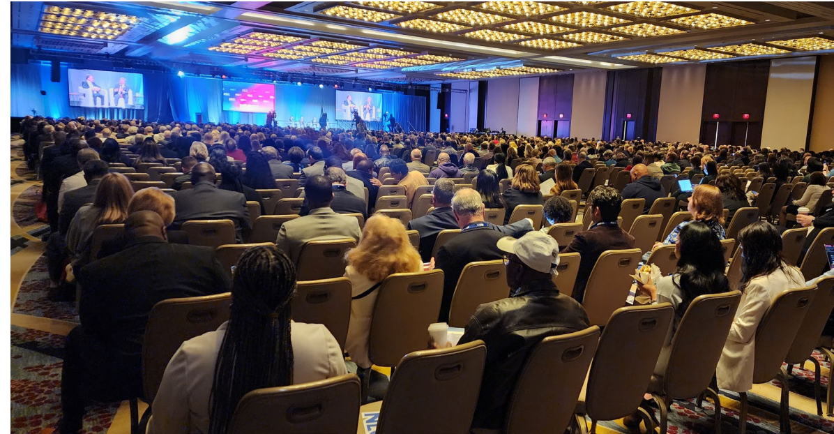
NLC Congressional Cities 2025

*Early registration and booking can help reduce costs