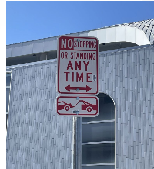
West Side of N El Paso St: No Stopping or Standing Any Time, Tow Away

REMOVE THIS BOX ONCE THE PRESENTATION IS FINALIZED.