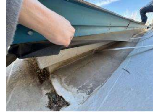
Under the vinyl Membrane