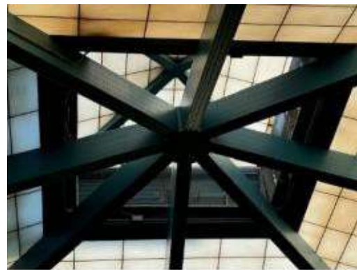
Interior view of Structure & Raised Louvers