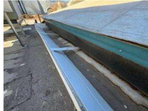
Roof Flashing, Membrane, & Gutter