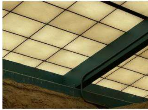
Box beam connections