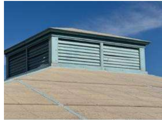
Exterior Fiberglass Panels & Louvers