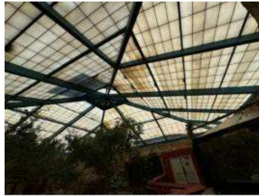
Interior of Fiberglass Panels & Structure