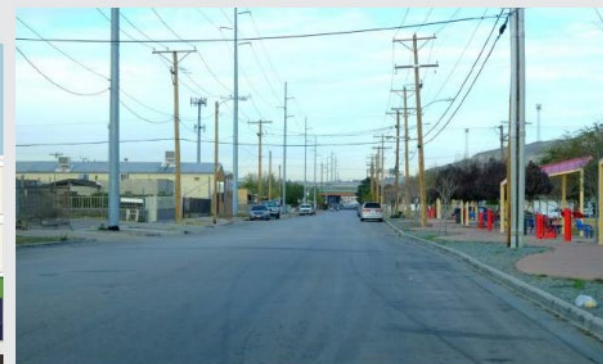
Durazno Ave. existing facing west along Saipan Park