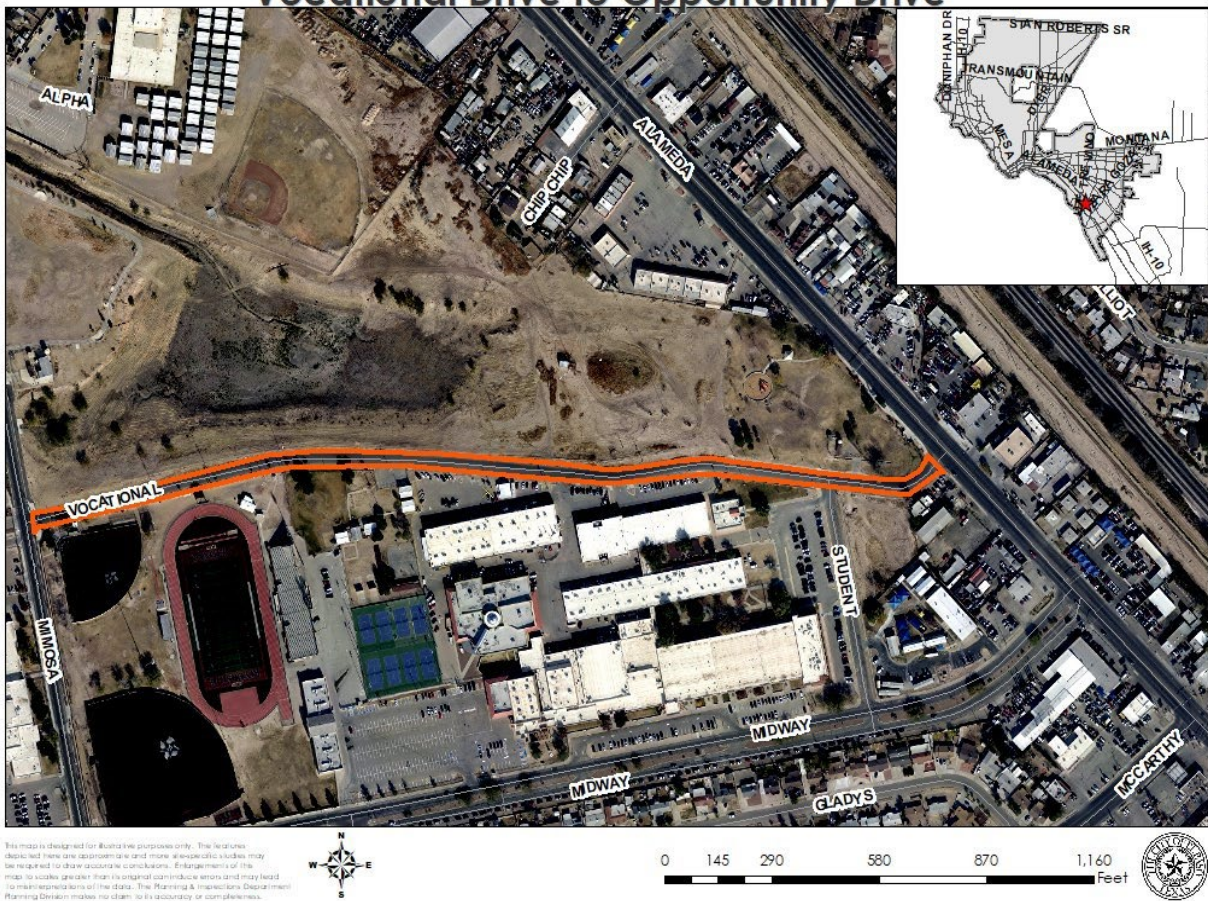
Figure A: Proposed plat with surrounding area