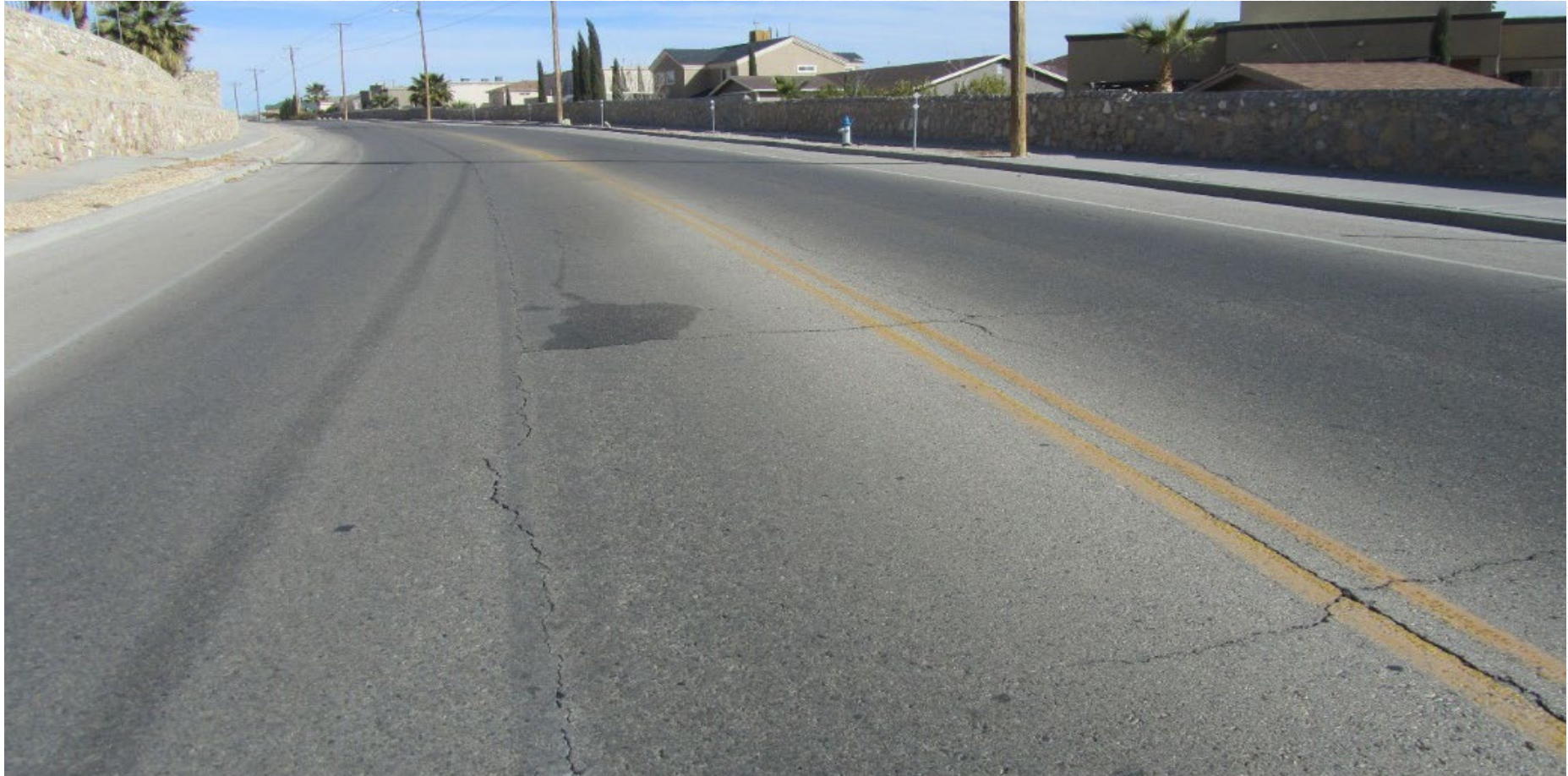
■ TED HOUGHTON DRIVE