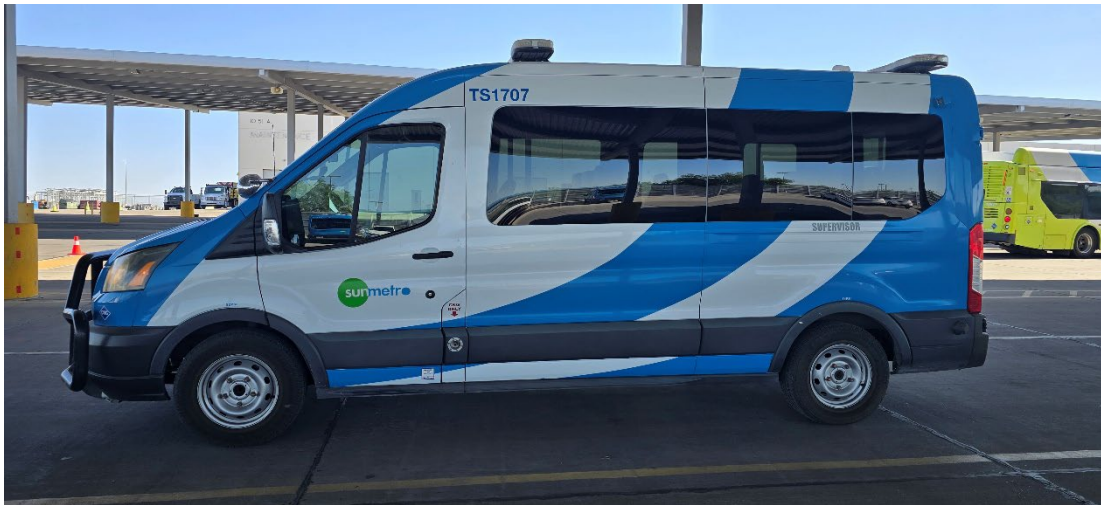
Figure 1: 2017 Ford Transit Extended CNG Van