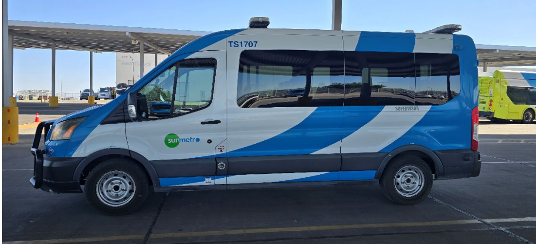
Figure 1: 2017 Ford Transit Extended CNG Van