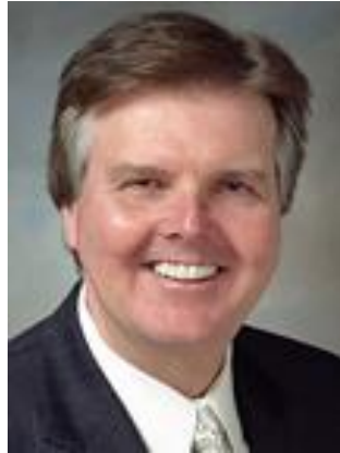
Lt. Gov. Dan Patrick (R)