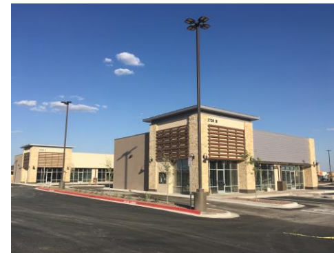
Property uses in the area