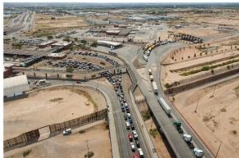
Ysleta-Zaragoza Port of Entry