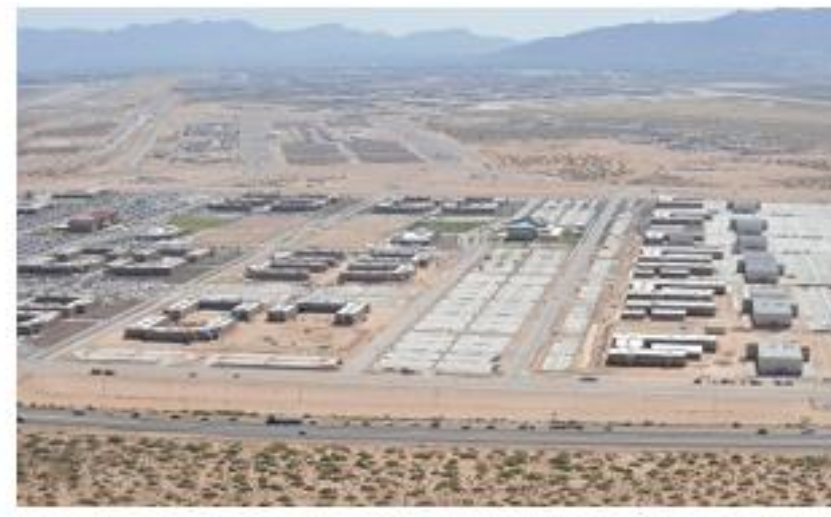
Fort Bliss Partnership and Agreements