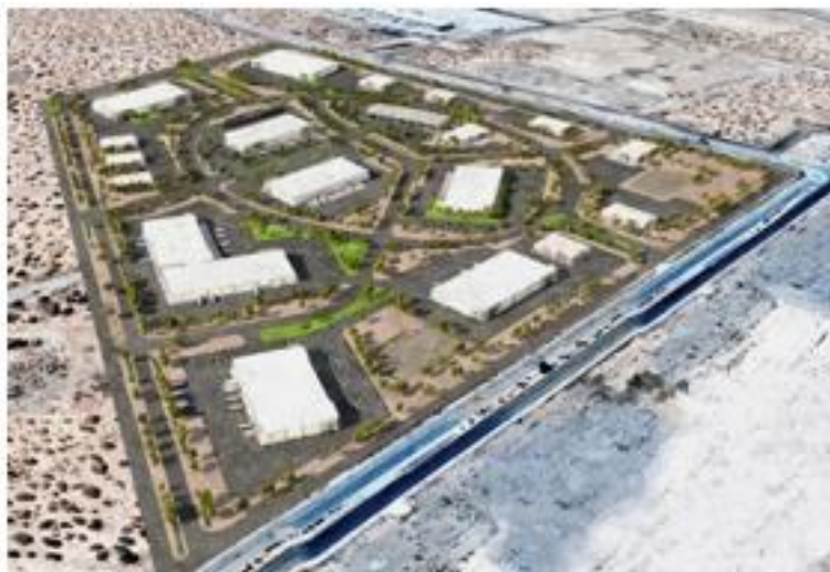
Advanced Manufacturing District